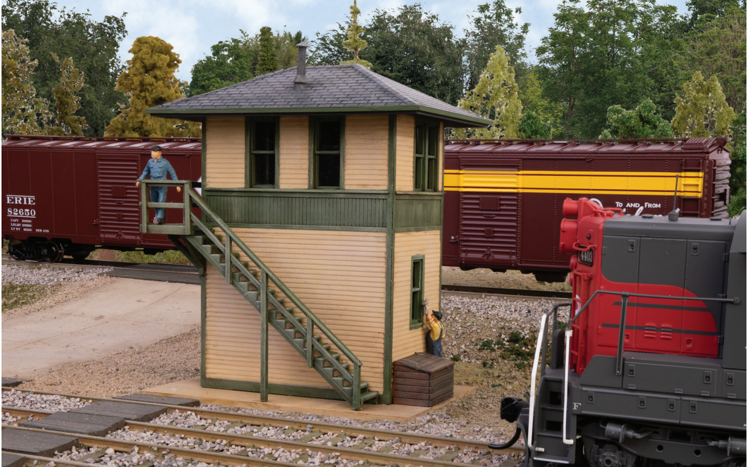
Figures, vehicles, railroad equipment, and scenery items not included.