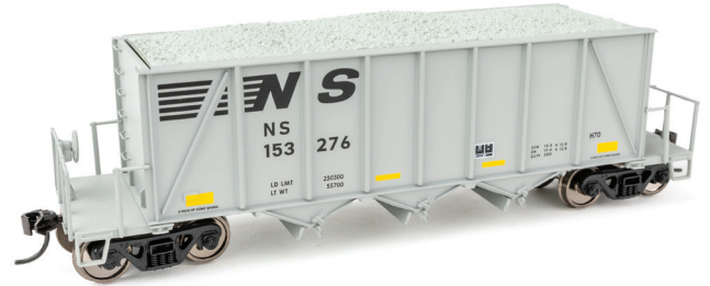
Norfolk Southern 920-106043 #153276 920-106044 #153388 920-106045 #153397