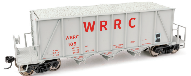
Western Railroad - WRR 920-106046 #105 920-106047 #141 920-106048 #207