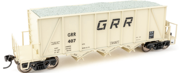
Georgetown Railroad 920-106040 #407 920-106041 #411 920-106042 #436