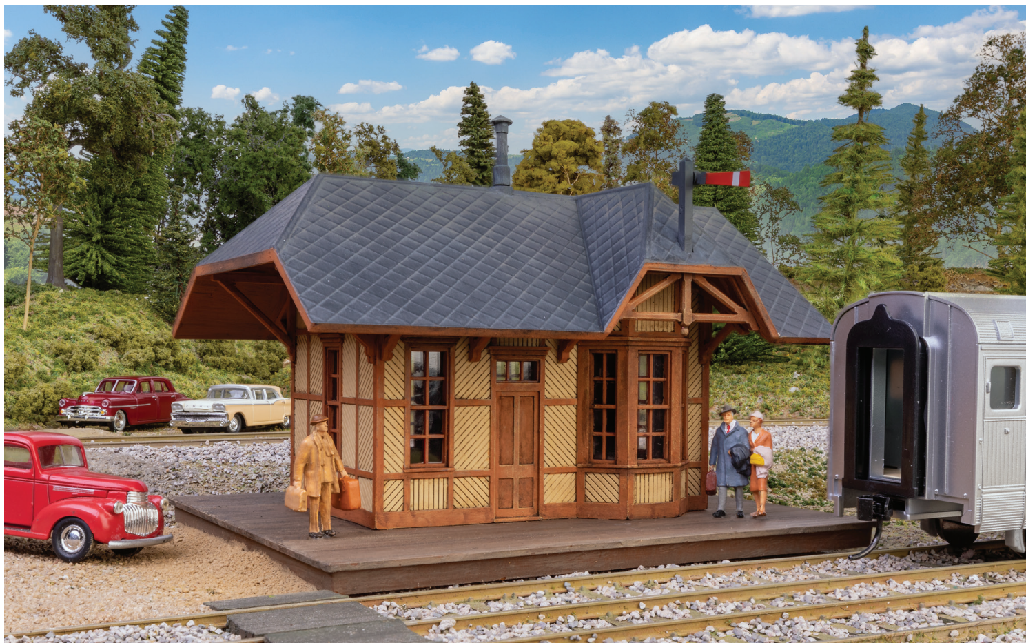
Figures, vehicles, railroad equipment, and scenery items not included.