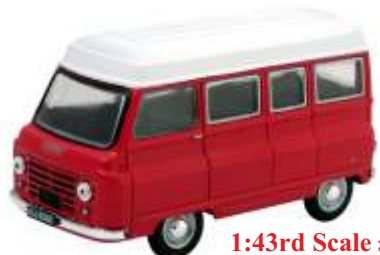
1:43rd Scale £10.95