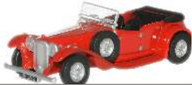
Alvis Speed 20 Regency Red 1930-1950's NEW