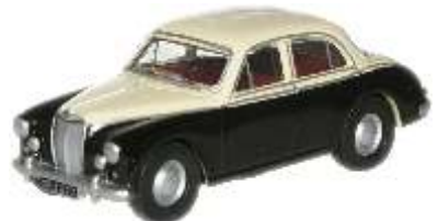
MGZB Two Tone Ivory/Black 1950-1960's NEW