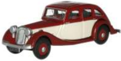
Riley Kestrel Maroon/Ivory 1930-1950's NEW

More releases to satisfy those who wanted some cars from the the 1930's, the Standard Flying 12 made its debut at the 1935 Motor Show. Authentic colour variations add to the appeal of this popular 'between the wars' family saloon car.