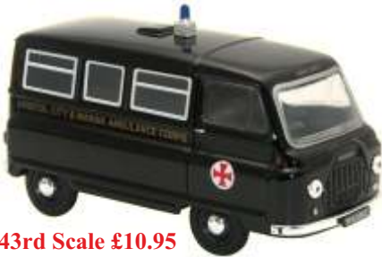
1:43rd Scale £10.95