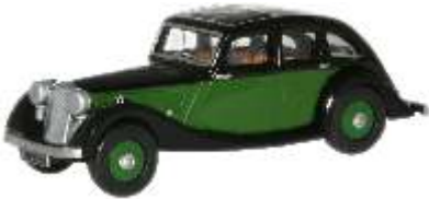
Riley Kestrel Green/Black 1930-1950's NEW