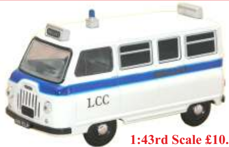
1:43rd Scale £10.95