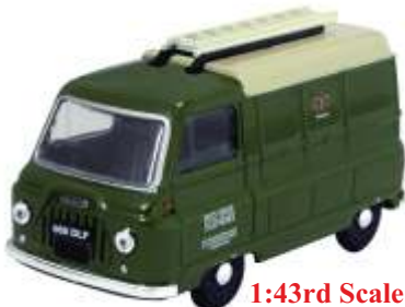
1:43rd Scale £10.95