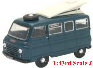
1:43rd Scale £10.95