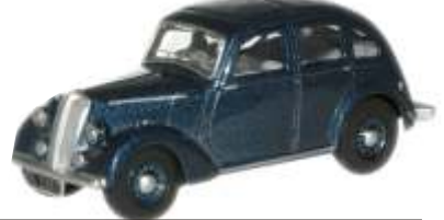
Standard Flying 12 Blue 1930-1950's NEW