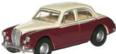
MGZB Ivory/Autumn Red 1950-1960's NEW

This dual colour paint scheme on the ZB Magnette was known as Varitone. In modelling the Ivory/Black version, which appeared in real life in 1957, we have chosen a colour scheme that complements perfectly the gleaming chrome work on the front, sides and rear of the vehicle. Luxuries on the 'real thing' also included a polished wood dashboard and leather seats. Launched in 1956 this model has proved to be popular in our 1:43rd range as well.