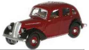
Standard Flying 12 Maroon 1930-1950's NEW

The Kestrel evoking the image of a 1930s owner behind the wheel of his treasured piece of British engineering, exuding a certain air of opulence!