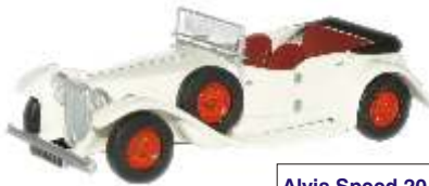
Alvis Speed 20 Cream 1930-1950's NEW

Just a sobering reminder – if you wanted to buy one of these very rare beasts today – if you could find one in restored condition, it would knock you back at least £30K! So definitely not something that will appear on the front of my drive - not yet anyway. TAFF !