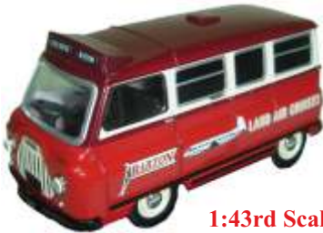
1:43rd Scale £10.95