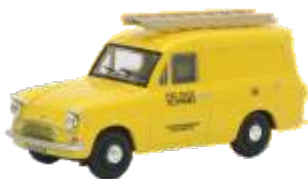
76ANG006 Post Office