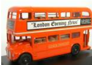
London Transport Routemaster