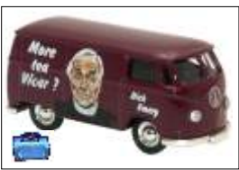
VW032 DICK EMERY