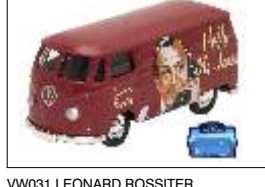
VW031 LEONARD ROSSITER