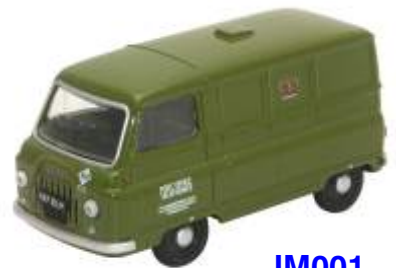
JM001 Post Office Edition 2,000