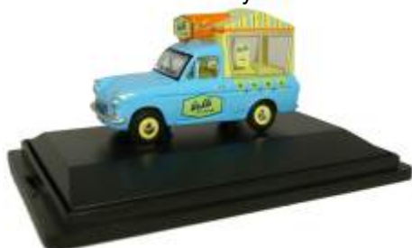
76ANG002 Walls Ice Cream