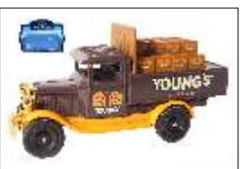
OT008 YOUNGS BITTER