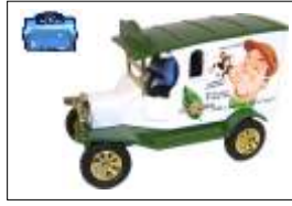
CS038 MURRAY MINTS