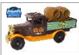
OT011 GOLD ZEST