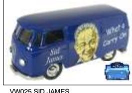
VW025 SID JAMES