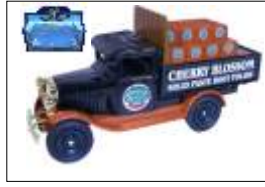
CS039 CHERRY BLOSSOM