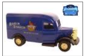
CS031 ROBIN STARCH