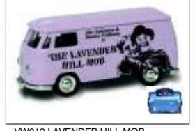
VW012 LAVENDER HILL MOB