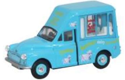
Morris Minor Tonibell Ice Cream