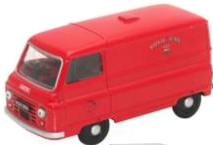
JA002 Austin J2 Royal Mail Edition 2,000