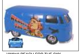
VW019 REACH FOR THE SKY