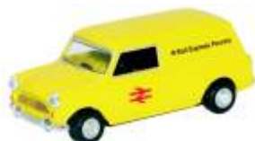
76MV011 Rail Express