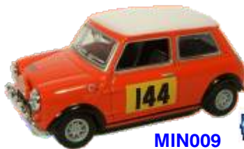
MIN009 Monte Carlo Edition 2,000