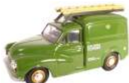
76MM007 Post Office