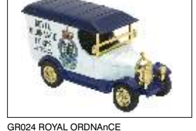
GR024 ROYAL ORDNANCE