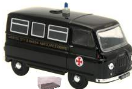
JM003 Morris J2 - Bristol City Edition 2,000