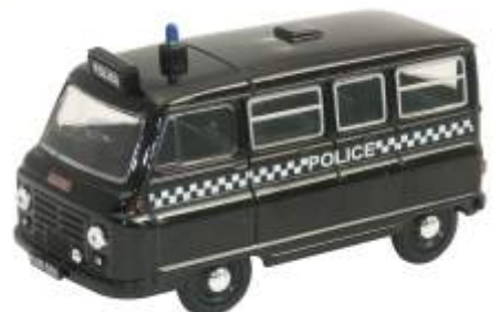
JA004 Austin J2 Police Edition 2,000