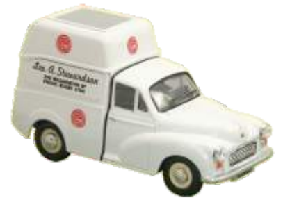
Morris Minor High Top Pink Paraffin