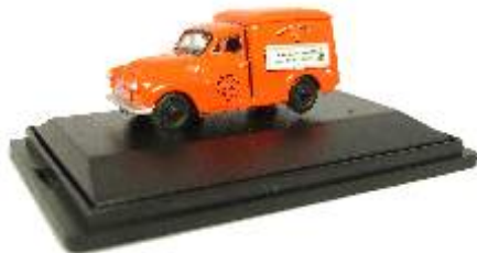
76MM015 Royal Mail Morris Minor