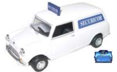
MV020 Securicor Edition 2,000