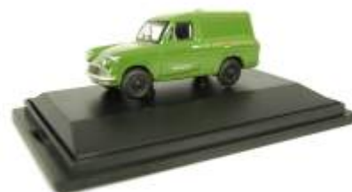
76ANG005 Post Office Anglia