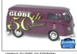
VW013 GLOBE 50 EDITION