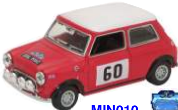
MIN010 Monte Carlo Mini 60 Edition 2,000