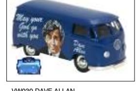
VW030 DAVE ALLAN