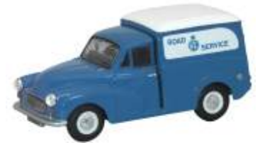
RAC Morris Minor