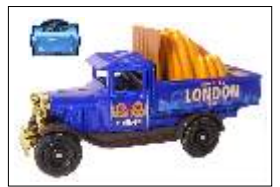
OT010 LONDON SPECIAL ALE