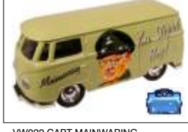
VW022 CAPT MAINWARING