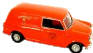
76MV007 Royal Mail