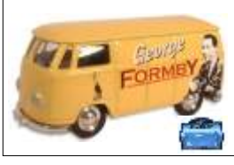
VW015 GEORGE FORMBY