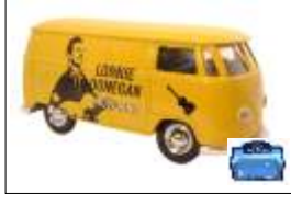
VW017 LONNIE DONNEGAN