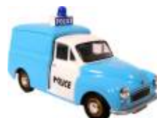
76P008 Morris Minor Police