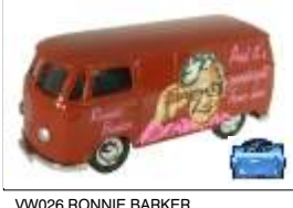
VW026 RONNIE BARKER