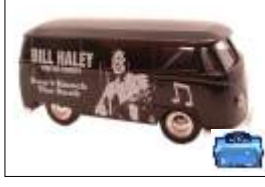
VW018 BILL HALEY