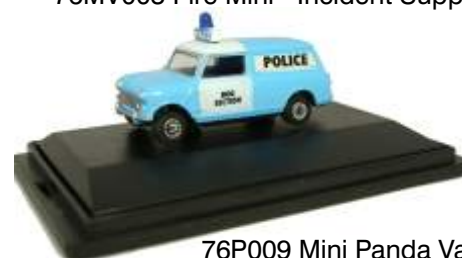
76P009 Mini Panda Van