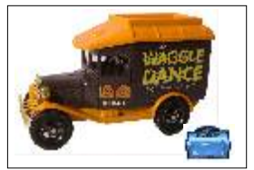
OT012 YOUNGS WAGGLE DANCE