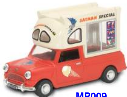
MP009 Batman Special Edition 2,000