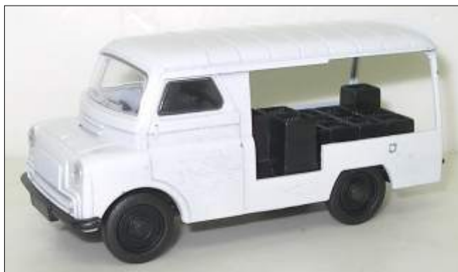
CA Tooling Shots - showing the Milk Float variant The grille detail hasn't been added yet.