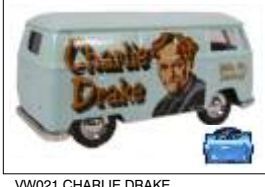
VW021 CHARLIE DRAKE