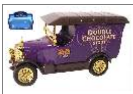
OT009 DOUBLE CHOCOLATE