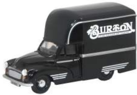
Burton - The Tailor of Taste