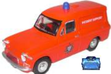
ANG022 London Fire Edition 2,000