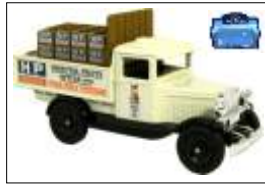
CS033 HP SAUCE