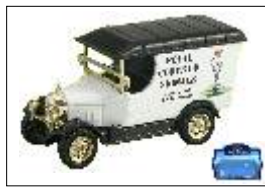
GR025 ROYAL CORPS OF SIGNAL

Buy ONE take ONE - for this page only - all models £4.95 - for every model you select on this page you can have another absolutely FREE. It's as simple as that - offer runs only during July 2007. Offer subject to availability.