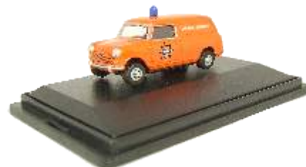
76MV003 Fire Mini - Incident Support