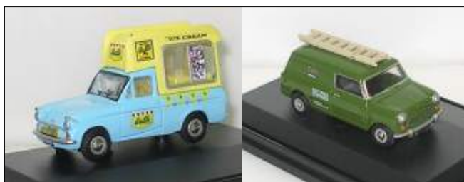
1:76 pre-production models which will appear in the coming months.

These are some of the first shots/pre-production pictures of some of the forthcoming releases. Increasingly we are receiving new components each week. Following the Bedford CA and HA will be a further 1:43rd release and Rob and I are working on the prototypes at the moment. As always I'll take the credit for the good bits and anything that's wrong is his fault!