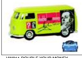
VW011 DOUBLE YOUR MONEY