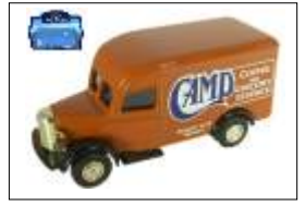
CS037 CAMP COFFEE