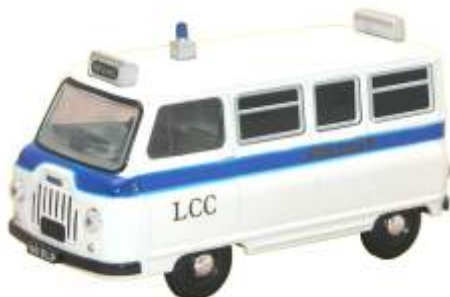
JM004 LCC Edition 2,000