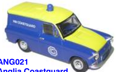
ANG021 Anglia Coastguard Edition 2,000