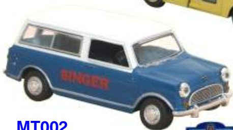
MT002 Singer Edition 2,000