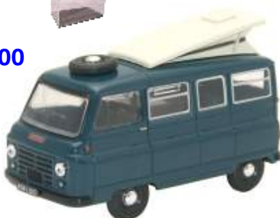
JA003 Camper Edition 2,000