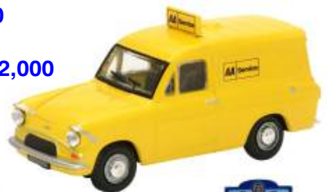
ANG010 AA Edition 2,000