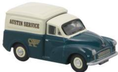
76MM042 Austin Service