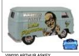
VW020 ARTHUR ASKEY