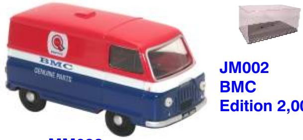
JM002 BMC Edition 2,000