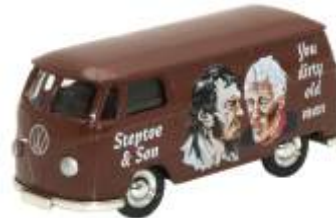
Steptoe & Son