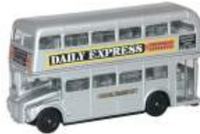
Routemaster Silver Daily Express