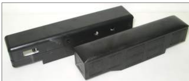
Long Trailer rear ends which will fit over a low loader section.