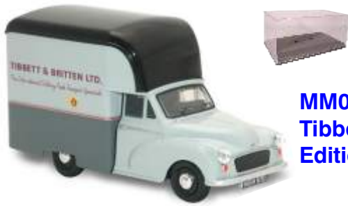
MM034 Tibbett & Britten Ltd Edition 2,000