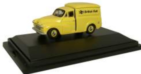
76MM030 British Rail Morris Minor