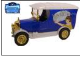
CS041 FOXS GLACIER MINTS