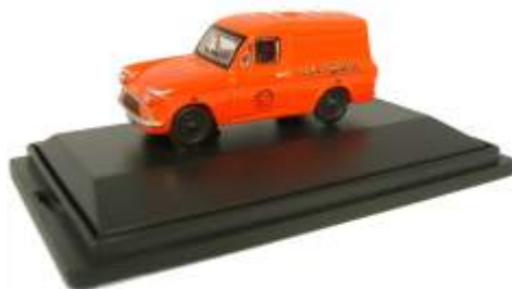
76ANG004 Royal Mail Anglia