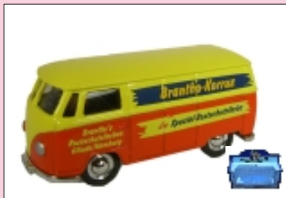
VW023 BRANTHO KORRUX