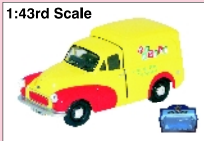
MM025 TY HAFAN