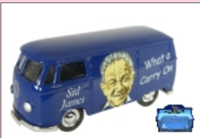
VW025 SID JAMES