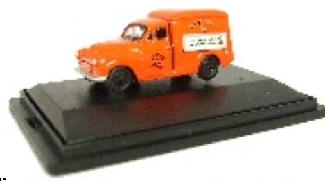
76MM015 Royal Mail Morris Minor