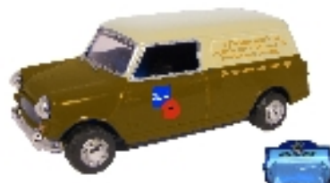
MV017 IN FLANDERS FIELDS