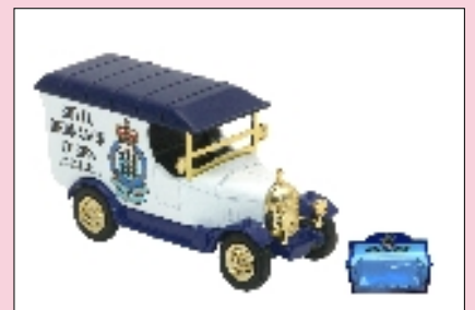
GR024 ROYAL ORDNANCE