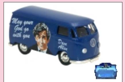
VW030 DAVE ALLAN