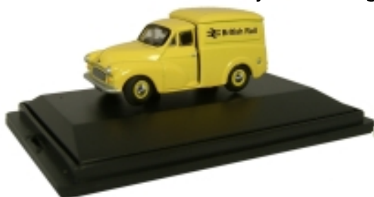
76MM030 British Rail Morris Minor