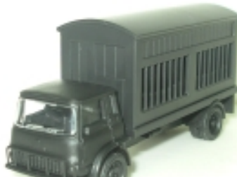
CH002 Chipperfields Lion