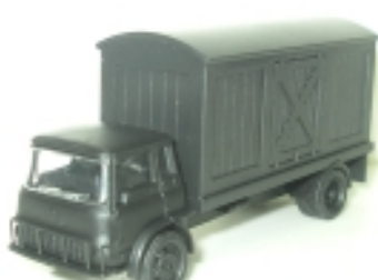
CH003 Chipperfields Elephant