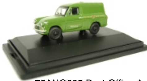
76ANG005 Post Office Anglia