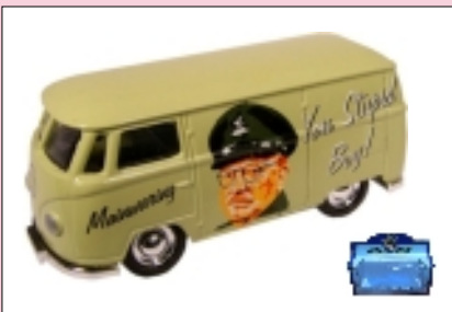
VW022 CAPT MAINWARING