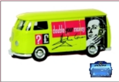
VW011 DOUBLE YOUR MONEY