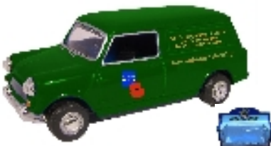
MV018 AT THE GOING DOWN