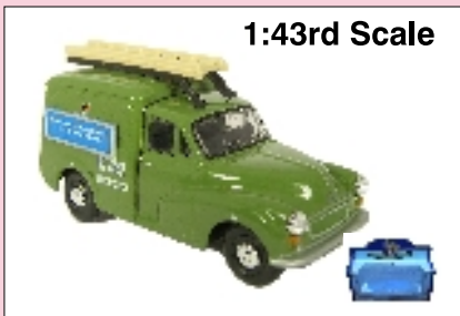
MM028 POST OFFICE TELEPHONES