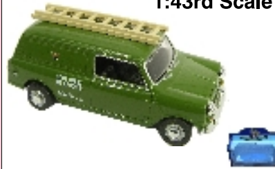
MV013 POST OFFICE