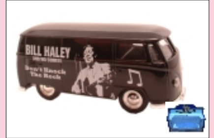
VW018 BILL HALEY