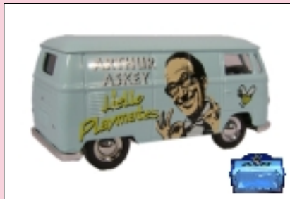
VW020 ARTHUR ASKEY