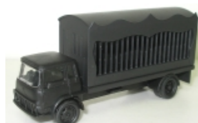
CH004 Chipperfields Leopard