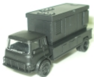
CH001 Chipperfields Generator

The first shots featuring the Chipperfields 1:76 scale Bedford TK look really nice. Like the above they will be ideal for railway collectors and will come packaged on a plinth