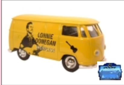
VW017 LONNIE DONNEGAN