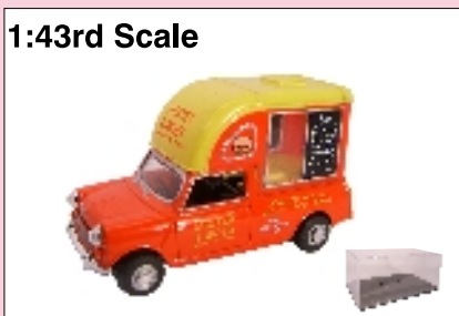
MP004 MISTER BURGER