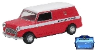
MV012 ROYAL MAIL