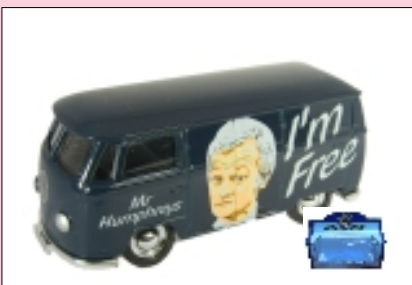
VW028 JOHN INMAN