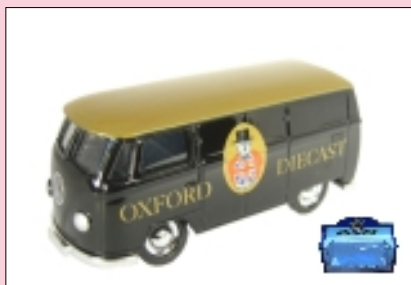
VW029 OXFORD DIECAST