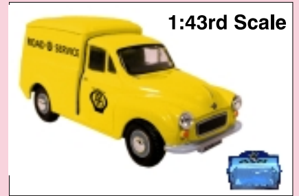
MM016 AA OLD LOGO