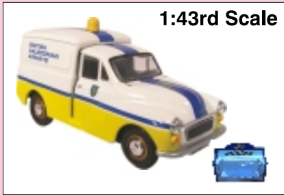
MM008 BRITISH CALEDONIAN