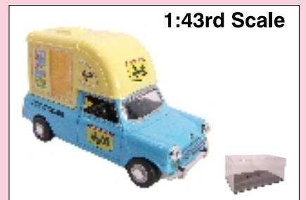
MP008 MINI WALLS SPECIAL PACK