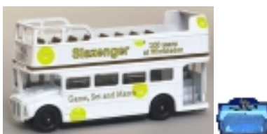
RM045 WIMBLEDON OPEN