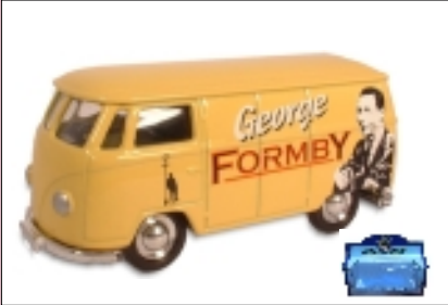
VW015 GEORGE FORMBY