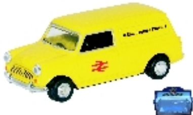
MV011 RAIL EXPRESS