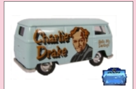
VW021 CHARLIE DRAKE