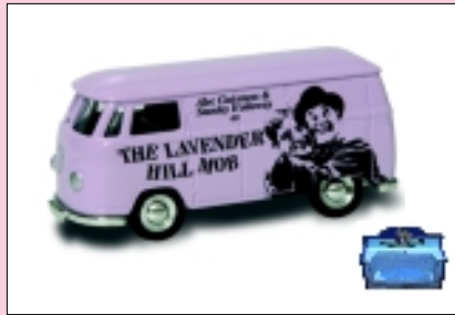
VW012 LAVENDER HILL MOB