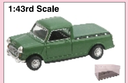
MP003 MINI TONNEAU