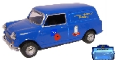
MV016 REMEMBRANCE SUNDAY