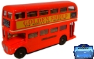
RM083 GOLDEN SHRED