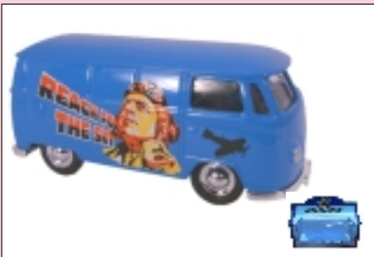
VW019 REACH FOR THE SKY