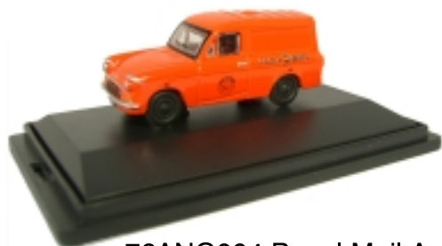
76ANG004 Royal Mail Anglia

Standard and Platinum members will get the 76ANG002 as part of their re-joining package. Demand for our products has been so high that we anticipate sending these free items out in May. We have produced 2,500 of each these liveries (more of the 76ANG002) and they are not certificated as we will produce more if required to satisfy the demand of railway collectors. The railway fraternity is aware of their existence and at the time of writing - it looks as though we may have underestimated demand. We apologise for anyone who may have to wait a few weeks because of this.