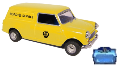
MV006 MINI VAN AA OLD LOGO