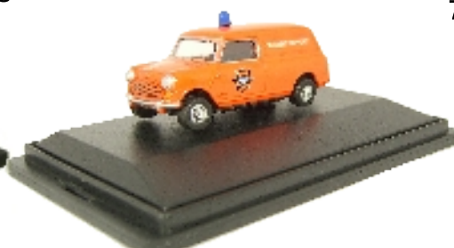
76MV003 Fire Mini - Incident Support