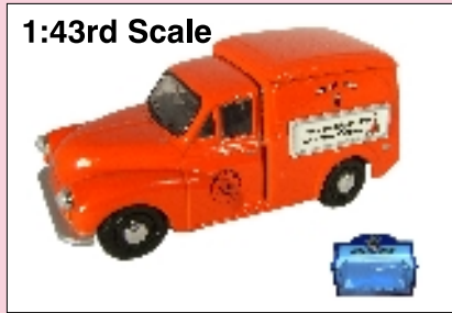
MM015 ROYAL MAIL