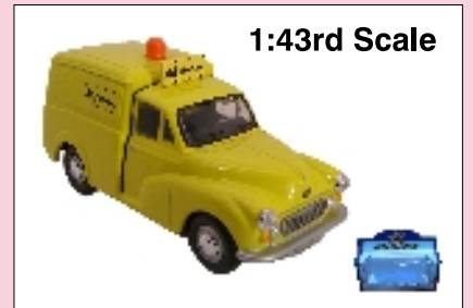
MM027 AA NEW LOGO