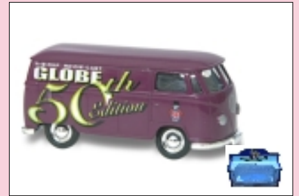
VW013 GLOBE 50 EDITION