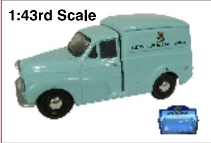
MM020 TELEVISION PO