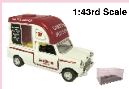
MP005 CREPES MAISON