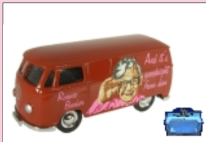
VW026 RONNIE BARKER