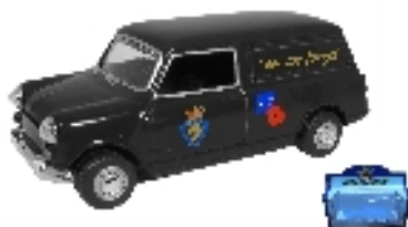
MV015 LEST WE FORGET