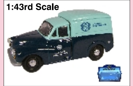
MM022B ATV BLUE