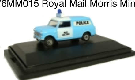
76P009 Mini Panda Van