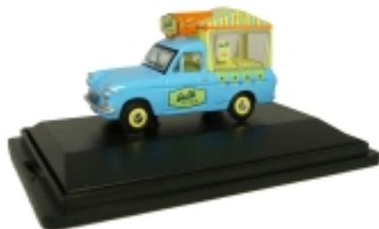
76ANG002 Walls Ice Cream

As promised we are releasing the first of our series of 1:76 models. This is an exciting new range and one that is set to grow over the next few years. We start with some popular liveries on the Mini, the Morris Minor and Anglia. They are railway scale (00) and come competitively priced at £2.95 each, on a plinth with a clear plastic top. You can buy as 6 for 4 purchasing. Next month as well as featuring some more liveries we release news on the next set of 1:76 castings. These models are ideal for railway collectors and we have already had very positive reviews on recent shows.