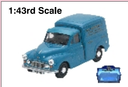
MM023 TOBACCO HEWERTSON