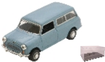
MT001 MINI TRAVELLER