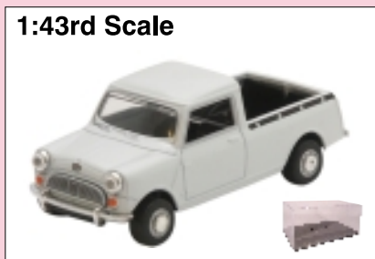
MP002 MINI PICK UP GREY