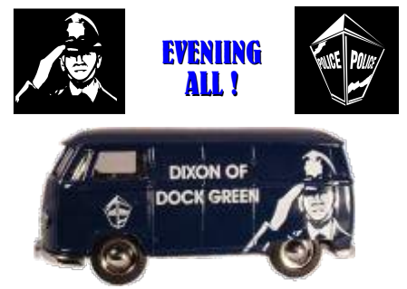
VW016 DIXON OF DOCK GREEN Edition 2,000