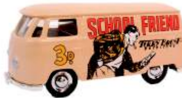
CC029 SCHOOL FRIEND Edition 2,000