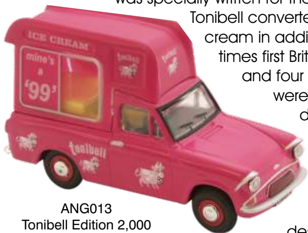
ANG013 Tonibell Edition 2,000

The name Tonis was changed to Tonibell in 1960 because competitors began using Tonis name and colours. All vehicles were painted blue, and Tonibell's cow symbol made its debut with a new jingle that was specially written for the chimes. The following year soft ice-cream was introduced and Tonibell converted all existing vehicles to enable them to carry the soft type ice-cream in addition to their normal lines. The company changed hands several times first British American Tobacco then Lyons. Tonibell had eighteen depots and four franchise depots covering the whole country. Five hundred vans were involved in taking ice-cream to housing estates and other high density areas. In addition they had 15 ice-cream parlours, mainly in the London area, and again operated under franchise arrangements. It was at this time that the vans were painted pink. We have released two variants the original blue (ANG014) and the later pink (ANG013) and both come with special certificates. We previewed these last month and we anticipate despatching by the 15th/20th of October - we will stop taking orders sometime during the course of this Globe.