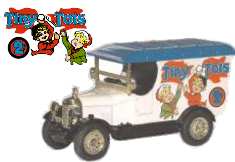
CC032 Tiny Tots Edition 1500