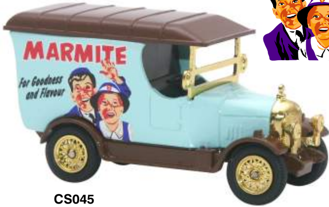
CS045 Marmite Edition 2,000