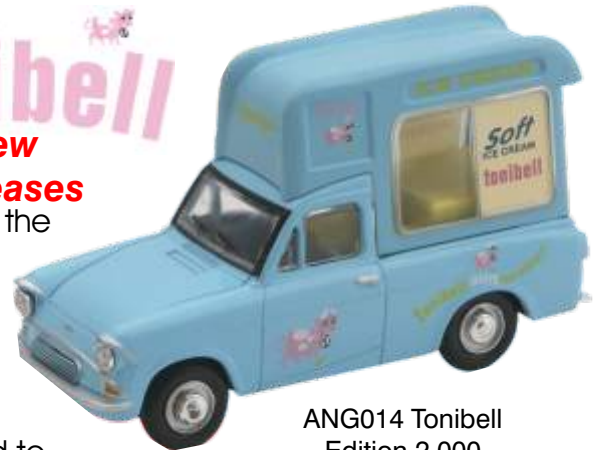
ANG014 Tonibell Edition 2,000

The name Tonis was changed to Tonibell in 1960 because competitors began using Tonis name and colours. All vehicles were painted blue, and Tonibell's cow symbol made its debut with a new jingle that was specially written for the chimes. The following year soft ice-cream was introduced and Tonibell converted all existing vehicles to enable them to carry the soft type ice-cream in addition to their normal lines. The company changed hands several times first British American Tobacco then Lyons. Tonibell had eighteen depots and four franchise depots covering the whole country. Five hundred vans were involved in taking ice-cream to housing estates and other high density areas. In addition they had 15 ice-cream parlours, mainly in the London area, and again operated under franchise arrangements. It was at this time that the vans were painted pink. We have released two variants the original blue (ANG014) and the later pink (ANG013) and both come with special certificates. We previewed these last month and we anticipate despatching by the 15th/20th of October - we will stop taking orders sometime during the course of this Globe.