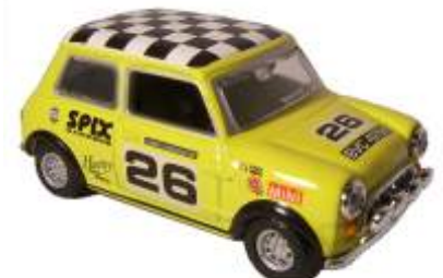
MIN003 Rally MINI Edition 2,000