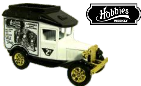
Model No MAG016 Edition 2,000