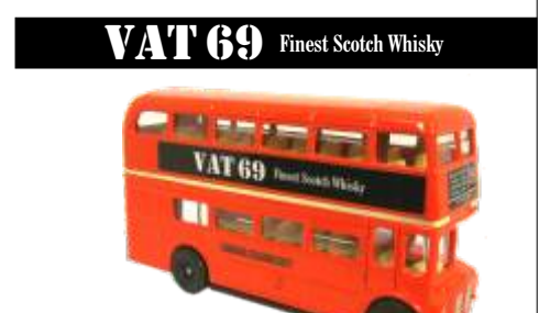
Model No RM081 Edition 2,000