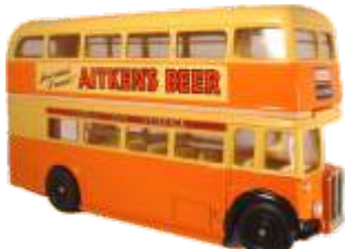
RT014 YOUNGS Edition 2,000