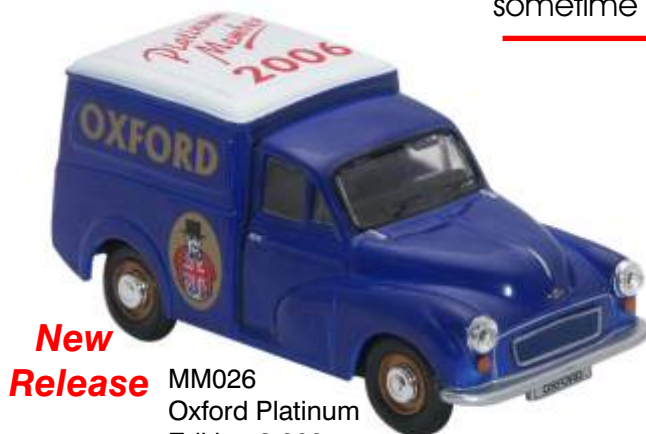
New Release MM026 Oxford Platinum Edition 3,000

As part of the change in the Membership packages that we are planning we will in future be upgrading the presentation of these. The Xmas vehicle will come in a presentation case as will next years Platinum vehicle.