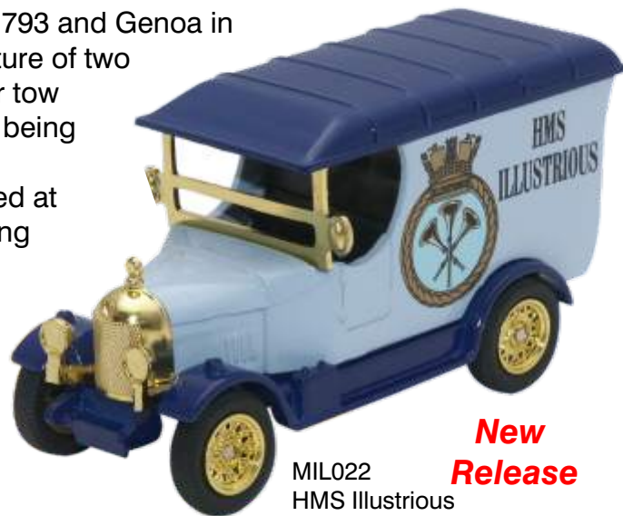
MIL022 HMS Illustrious Edition 2,000