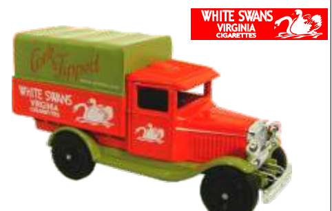
Model No CIG067 Edition 2,000