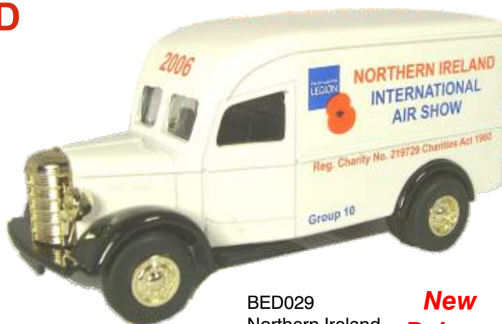
BED029 Northern Ireland Edition 1,300

We have just released this model for the Northern Ireland Air Show as a fundraiser. The edition is 1300 pieces and 500 pieces are available for members of the club. Many of you will know that we have used our models for many years to help the Legions fundraising and this year will be no exception with the release of four Mini vans planned for next month - keep your eyes peeled !!