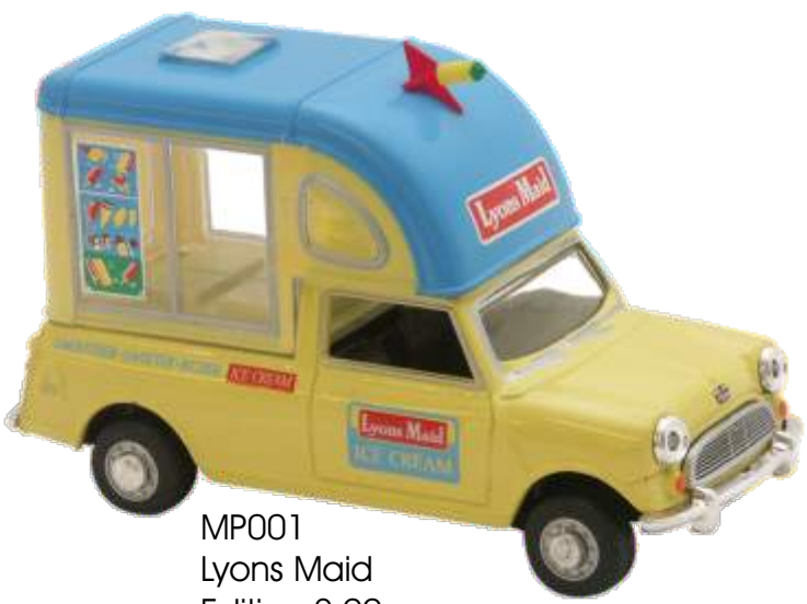
MP001 Lyons Maid Edition 2,00

These are the latest pre-production samples of the Mini Pick Up and Traveller which will be releasing shortly. The first of the series is the Lyons Maid Ice Cream Van which will be officially launched in the next Globe continuing the releases of Ice Cream tooling - the first release is the Lyons Maid and with a bit of luck we may also have some Tonibell variants! The models will release between November and January. I have made a small tooling change on the Ice Cream van which at the time of the Globe release should be cleared. We will take pre-orders from today for the MP001 Lyons Maid Ice Cream van as many of you have already tried to order them and want to secure for Christmas presents etc. These will be despatched under separate cover around mid November. The pick ups and travellers will release between November and January. The new tooling announcement for 1:43rd which will release in February will be made in Globe 84 and the 1:76 scale will be announced in Globe 85 for release March.