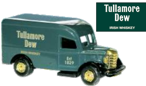
BED015 Tullamore Dew Edition 2000