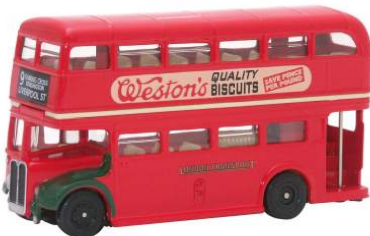
RT018 Westons Edition 2,000