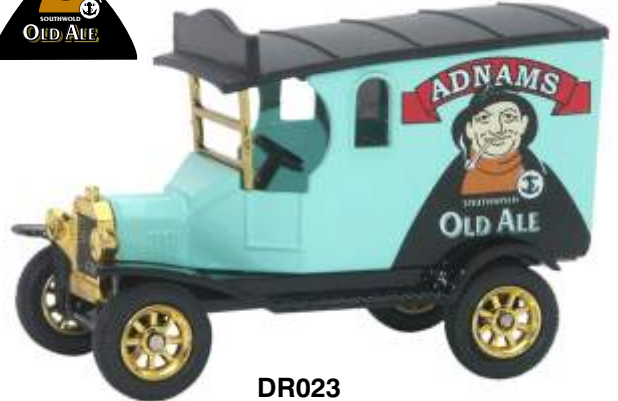
DR023 Adnams Edition 2,000