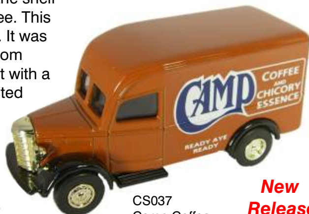
CS037 Camp Coffee Edition 2,000

goes that it was invented after Scottish soldiers asked for a coffee drink that could be brewed up easily by the army at camps in India. The label on the bottle is known throughout the world, showing a turbaned Indian waiting on an officer in a kilt while he sits relaxed sipping the brew. The officer has a striking similarity to TAFF (the knees we mean)!!