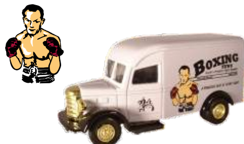
MAG015 Boxing News Edition 2,000