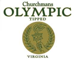
CIG074 Churchman's Olympic Edition 2,000