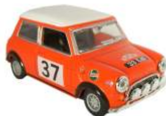
MIN004 Rally MINI Edition 2,000