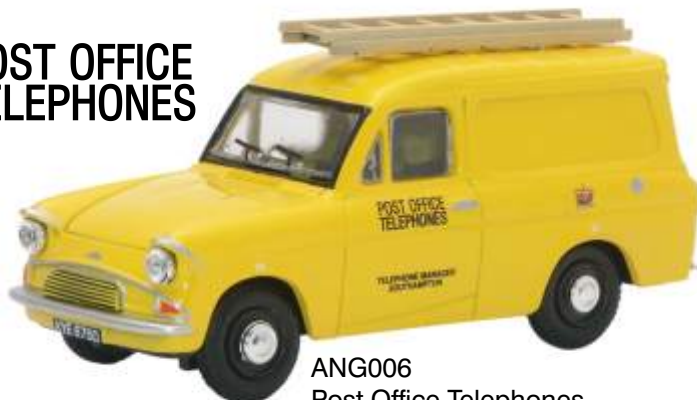
ANG006 Post Office Telephones Edition 2,000