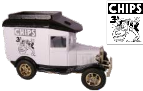
CC030 Edition 1,500