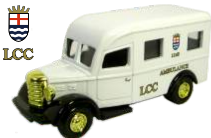
Model No P006 Edition 1,500