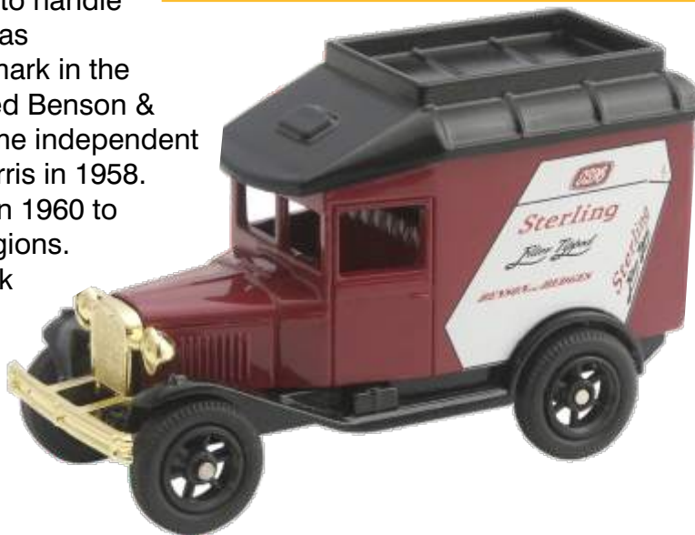
CIG075 Benson & Hedges Edition 2,000