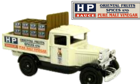
Model No CS033 Edition 1,500