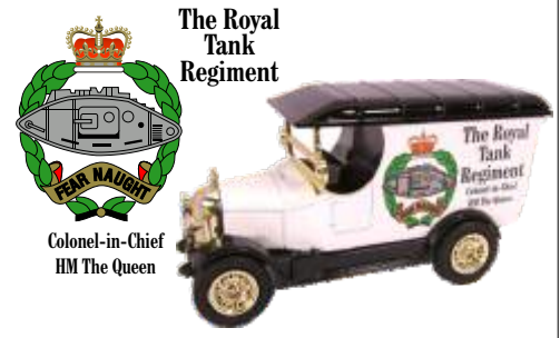
GR016 Royal Tank Edition 1,500