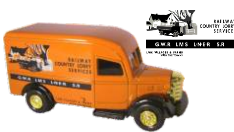
BED014 Railway Lorry Country Services Edition 2,000