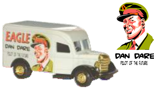
CC031 Dan Dare Edition 1,500