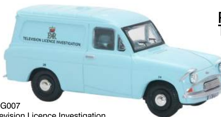
ANG007 Television Licence Investigation Edition 2,000