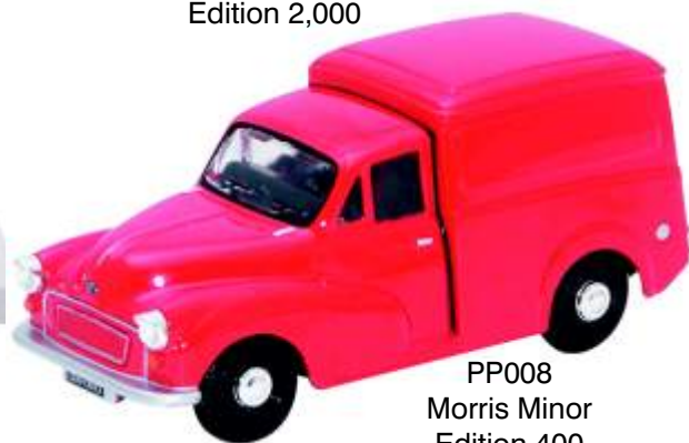
PP008 Morris Minor Edition 400