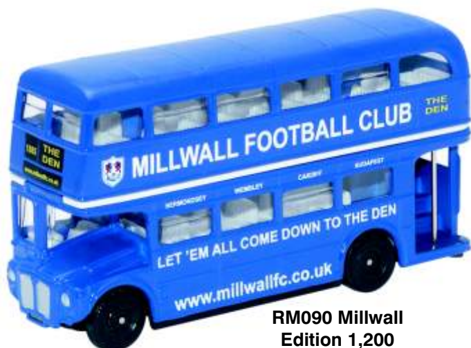
RM090 Millwall Edition 1,200