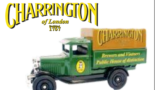
DR012 CHARRINGTONS Edition 2,000