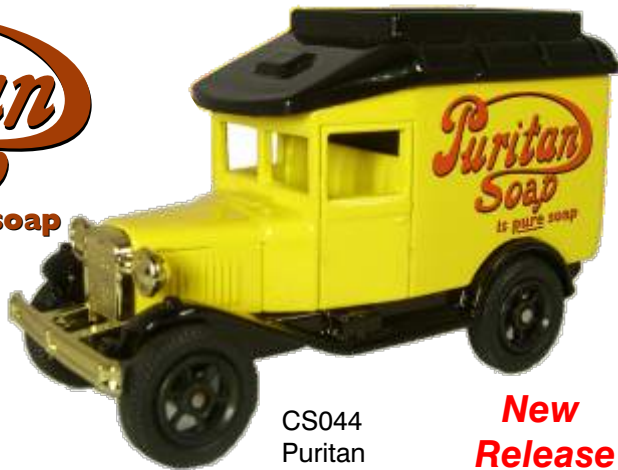
CS044 Puritan Edition 2,000

of soap in each. If you saved the cartons you could get a cup and saucer. Now I don't for one minute believe that Dusty used soap - I think he was more interested in the cup and saucer !