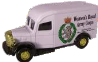
GR015 Women's Royal Army Corps Edition 1,000