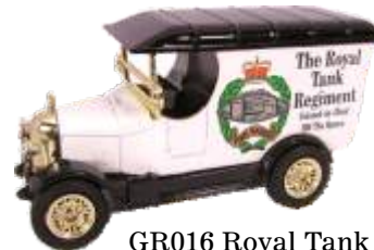
GR016 Royal Tank Edition 1,500