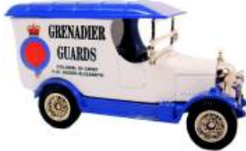
GR011 Grenadier Guards Edition 1,500