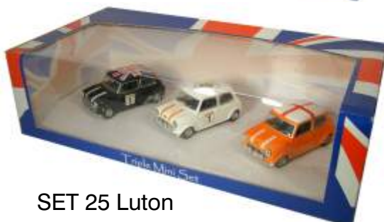
SET 25 Luton

An update on the Triple Sets that have been released this year.