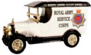
GR010 RASC Edition 1,500