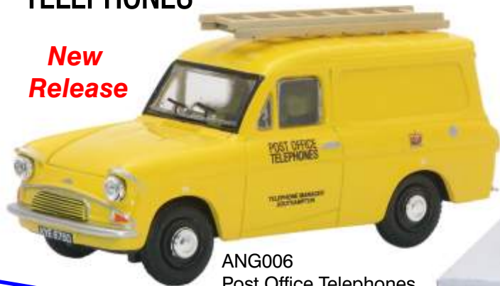
ANG006 Post Office Telephones Edition 2,000