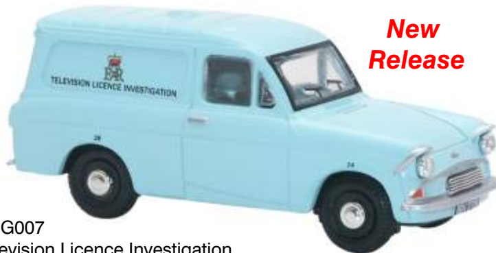
ANG007 Television Licence Investigation Edition 2,000

This month our three Anglias in Post office liveries, a nice compliment to the three Morris Minors issued earlier this year. You can buy them as singles or as a three piece set.