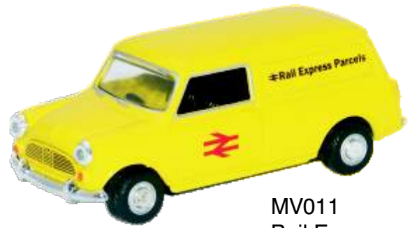
MV011 Rail Express Edition 2,000