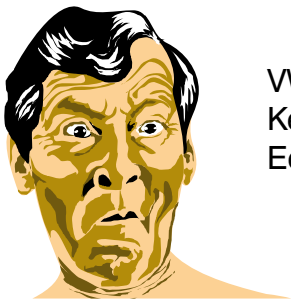
VW027 Kenneth Williams Edition 2,000