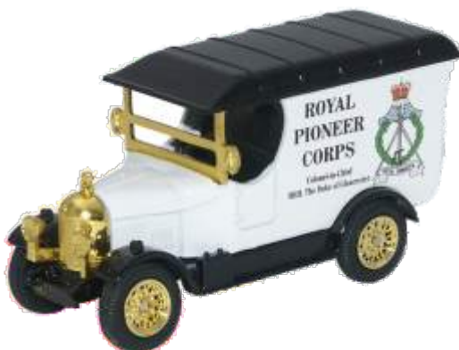
GR022 Pioneer Corps Edition 2,000