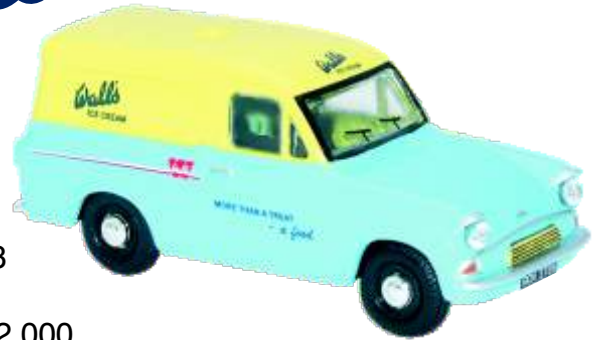
ANG008 Wall's Edition 2,000