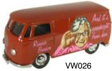
VW026 Ronnie Barker Edition 2,000

He was best known for his double-takes in the Carry On films and his contributions to radio series such as Round the Horne and Just a Minute, not to mention innumerable TV chat shows - he was also a talented stage actor, He appeared in 22 Carry On films and on radio he was an unstoppable winner of Just A Minute a. A great addition to the range.