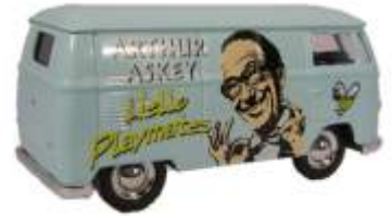
VW020 Arthur Askey Edition 2,000