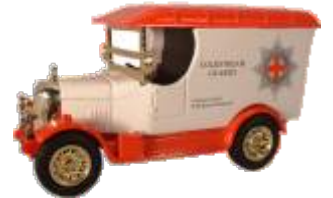
GR013 Coldstream Guards Edition 2,000