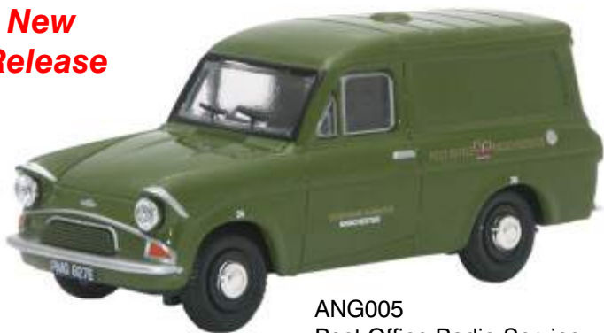
ANG005 Post Office Radio Service Edition 2,000