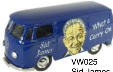
VW025 Sid James Edition 2,000