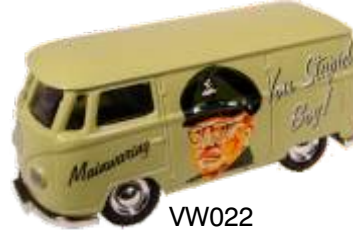
VW022 Capt Mainwaring Edition 2,000