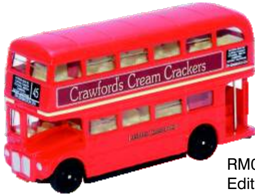
RM089 Crawford Edition 2,000