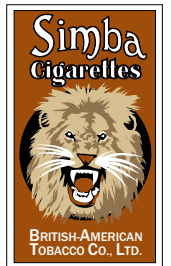
CIG073 Simba Edition 2,000