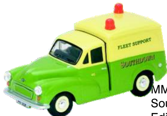
MM021 Southdown Edition 2,000