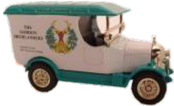
GR014 Gordon Highlanders Edition 1,500