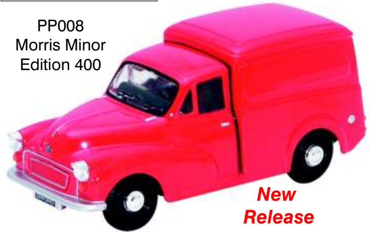
PP008 Morris Minor Edition 400