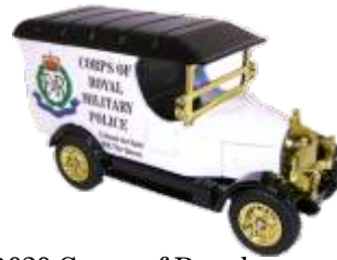
GR020 Corps of Royal Military Police Edition 1,500