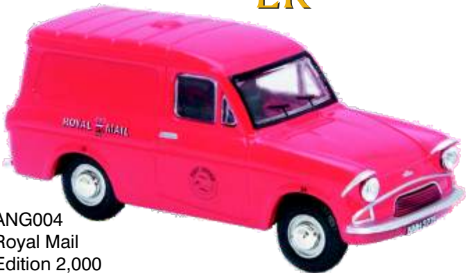
ANG004 Royal Mail Edition 2,000