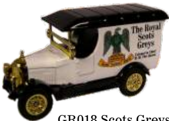
GR018 Scots Greys Edition 1,500