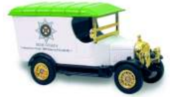
GR009 Irish Guards Edition 1,500