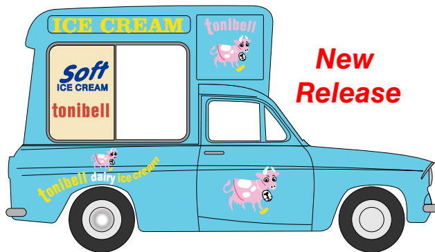
ANG013 Tonibell Edition 2,000