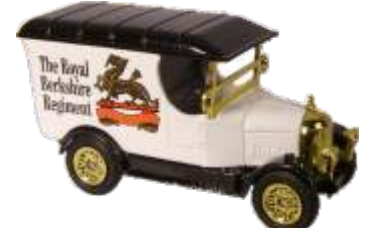
GR017 Royal Berkshire Regiment Edition 1,500