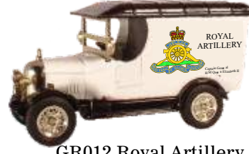
GR012 Royal Artillery Edition 2,000