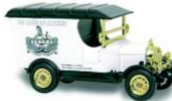
GR008 The Glosters Edition 1,500