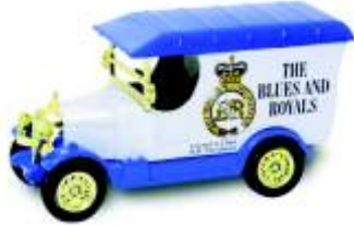
GR006 Blues & Royals Edition 1,500