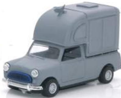
New Mini Variants