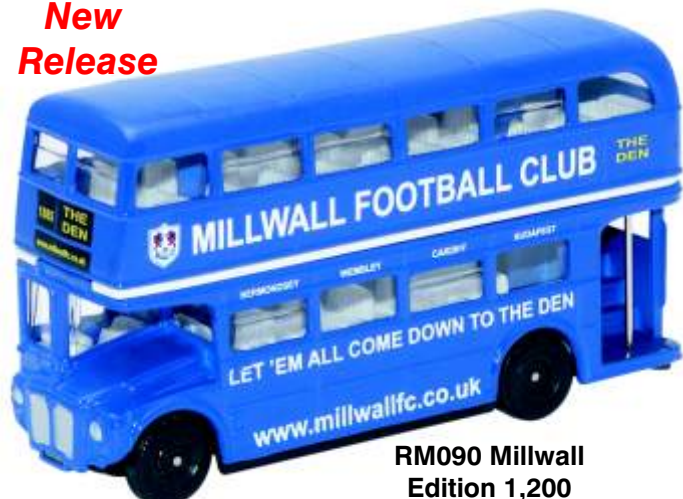
RM090 Millwall Edition 1,200

We released the Bullnose Millwall 064G in 1995 and RM036 in 2001 and here we are 5 years on with RM090, based on a bus that runs around Millwall. Millwall Rovers were formed in the summer of 1885 by workers at Morton's Jam Factory on the Isle of Dogs. The majority of the workers at the factory were of Scottish extraction and consequently blue and white became the club's colours. Millwall inhabited four separate grounds on the island and changed their name via Millwall Athletic to plain Millwall, before relocating across the river at The Den in 1910.