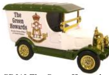
GR019 The Green Howards Edition 1,500