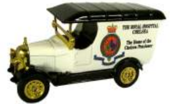
GR021 Chelsea Pensioners Edition 2,000