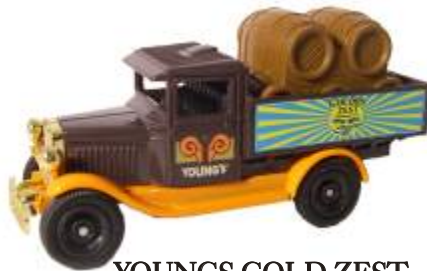
YOUNGS GOLD ZEST Model OT011 Edition 2,000