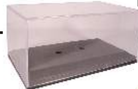
The new case for the Ice Cream models

These are pictures of the first production samples. The ANG003P has additional masking on the cab section which is being added, as this was left off the sample. There is also some missed printing on the ANG002P that has been added. The product is scheduled to arrive in our warehouse on the 3rd July and we will despatch all orders prior to mid July.