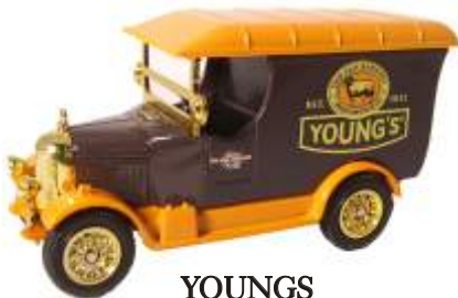
YOUNGS Model OT007 Edition 2,000