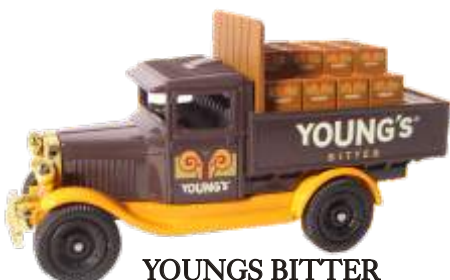
YOUNGS BITTER Model OT008 Edition 2,000