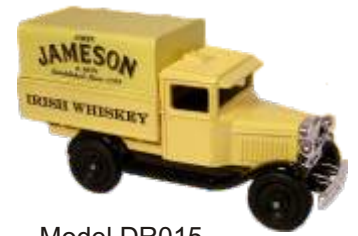
Model DR015 Edition 1,500