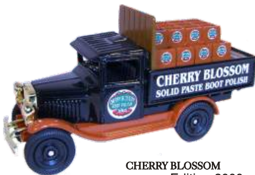
CHERRY BLOSSOM Model CS039 Edition 2000