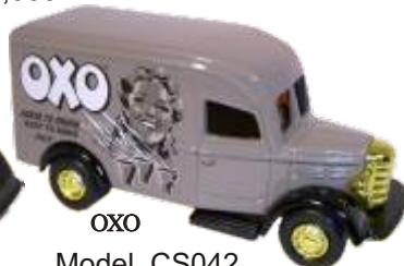
OXO Model CS042 Edition 2,000