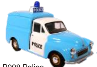
P008 Police Edition 2000