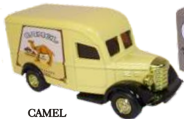
CAMEL Model CIG070 Edition 2,000