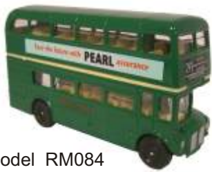
Model RM084 Edition 2,000 METROBUS PEARL ASSURANCE