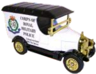
ROYAL MILITARY POLICE Model GR020 Edition 1500