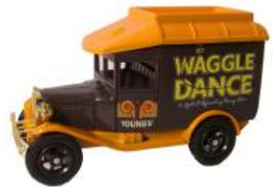
YOUNGS WAGGLE DANCE Model OT012 Edition 2,000