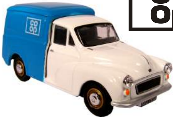
Model MM012 - Edition 2,000