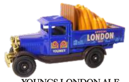
YOUNGS LONDON ALE Model OT010 Edition 2,000