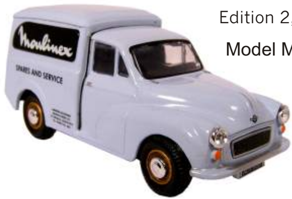
Edition 2,000 Model MM011