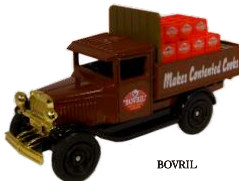
BOVRIL Model CS035 Edition 2000