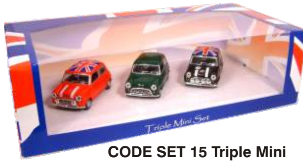
CODE SET 15 Triple Mini