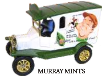
MURRAY MINTS Model CS038 Edition 2,000