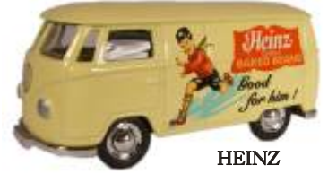
HEINZ Model VW024 Edition 2,000