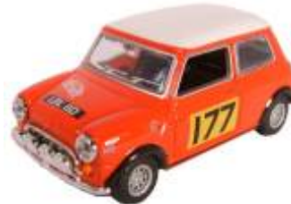
MIN002 Edition 2,000 MONTE CARLO