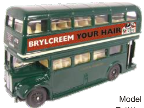
Model RT020 Edition 1,000