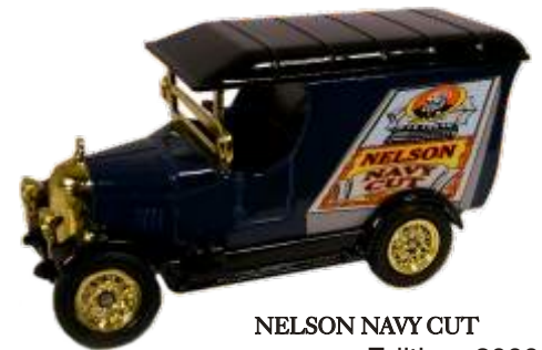
NELSON NAVY CUT Model CIG069 Edition 2000