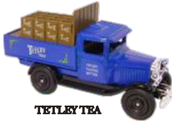
TETLEY TEA Model CS034 Edition 1500