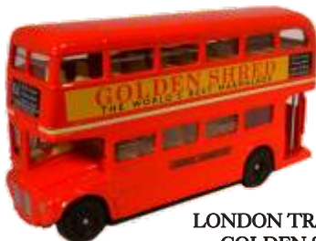
LONDON TRANSPORT GOLDEN SHRED Model RM083 Edition 2000