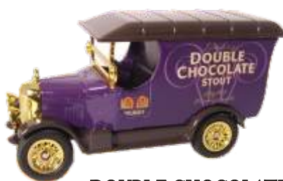
DOUBLE CHOCOLATE Model OT009 Edition 2,000