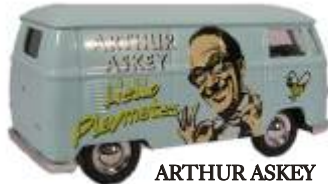
ARTHUR ASKEY Model VW020 Edition 2,000