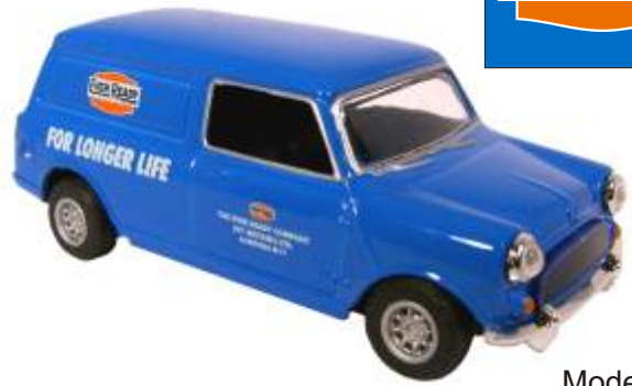
Model MV004 Edition 2,000