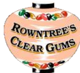
Limited Edition ROWNTREES Model CS040 of 2,000