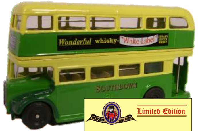
Limited Edition SOUTHDOWN Model RT016 of 2,000

Wonderful whisky- "White Label" DEWAR'S SCOTCH WHISKY