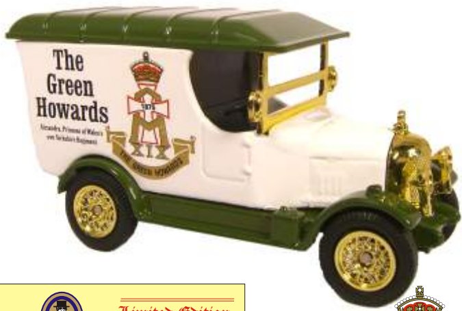
Limited Edition GREEN HOWARDS Model GR019 of 1,500