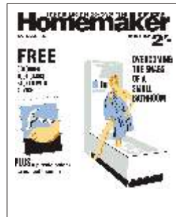
Limited Edition HOMEMAKER Model MAG017 of 2,000