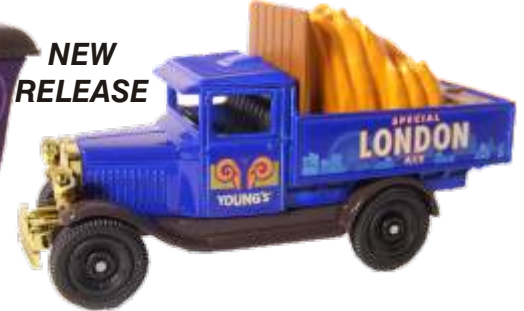
YOUNGS LONDON ALE