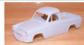
PICK UP VARIANT