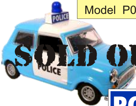
Limited Edition POLICE MINI CAR Model P010 of 2,000