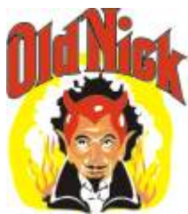
Limited Edition OLD NICK Model DR018 of 1,500