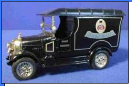
By The Members of Oxford Diecast & TAFF

Further to last months Globe we remind you of the rejoining gift for 2006 - all members rejoining during the year will be reserved a copy of this book which will be released towards the end of the year. All members will receive a copy which will include their membership number and name. We want you to send us letters, stories about your collections about the liveries we have shown on our vehicles and the memories of the brands concerned even stories about yourself and why you collect Anything about Oxford Diecast including our mistakes and things you have noticed that maybe we have missed. Pictures of you with your collections. We can't promise to use them all, but we'll try and include as much as possible: Send to: Oxford Diecast Ltd, DEPT ODS, PO Box 62, Swansea, SA1 4JW.