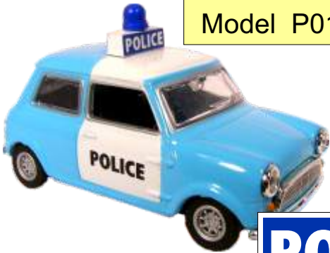
POLICE FNM 255E