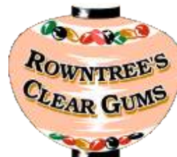
Limited Edition ROWNTREES Model CS040 of 2,000