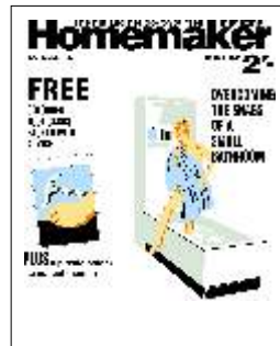
Limited Edition HOMEMAKER Model MAG017 of 2,000