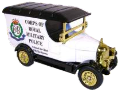
ROYAL MILITARY POLICE Model GR020 of 1,500