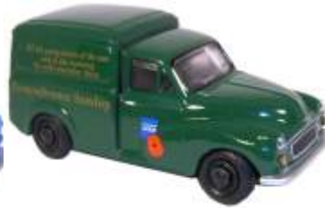
GOING DOWN OF THE SUN Model MM003 of 5,000