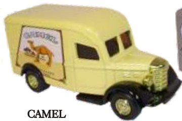
CAMEL Model CIG070 of 2,000