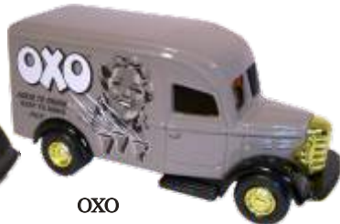
OXO Model CS042 of 2,000