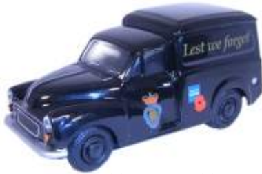
LEST WE FORGET Model MM002 of 5,000