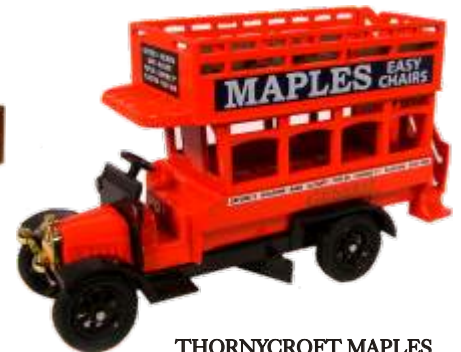
THORNYCROFT MAPLES Model B081 of 1,500