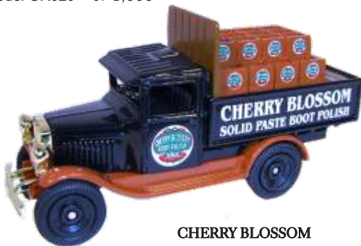
CHERRY BLOSSOM Model CS039 of 2,000