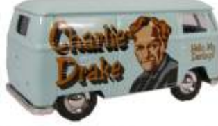
CHARLIE DRAKE Model VW021 of 2,000