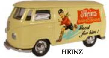
HEINZ Model VW024 of 2,000