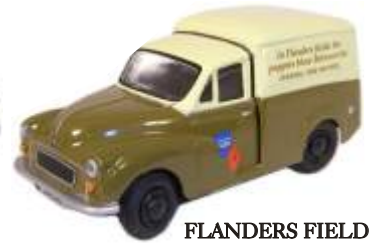
FLANDERS FIELD Model MM005 of 5,000