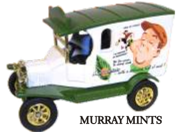
MURRAY MINTS Model CS038 of 2,000