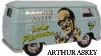
ARTHUR ASKEY Model VW020 of 2,000