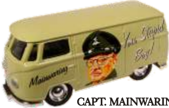
CAPT. MAINWARING Model VW022 of 2,000