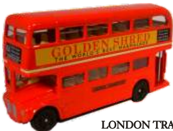
LONDON TRANSPORT GOLDEN SHRED Model RM083 of 2,000