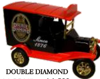
DOUBLE DIAMOND Model DR017 of 1,500