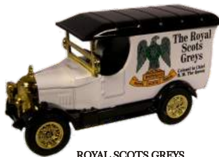
ROYAL SCOTS GREYS Model GR018 of 1,500