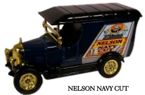
NELSON NAVY CUT Model CIG069 of 2,000