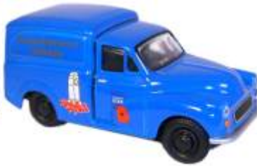
REMEMBRANCE SUNDAY Model MM004 of 5,000