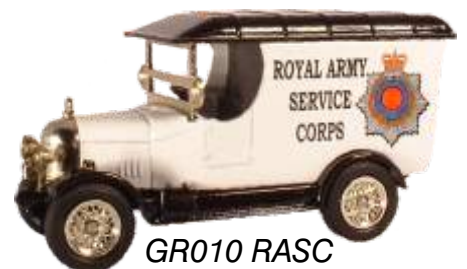
GR010 RASC Edition 1,500