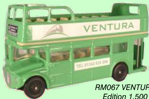
RM067 VENTURA Edition 1,500

Another release from Dawsons Rentals with an edition size of 1500. Only 300 are available for the club - so don't get caught out!!! Many of you will remember the previous Dawson buses RM052, RM019