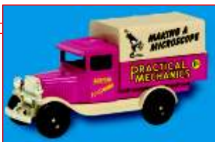
MAG007 PRACTICAL MECHANICS Edition 2,000

Continuing in our series of Practical Magazines comes Practical Motorist a particular favourite of mine. The first car I owned was a Mini and I had no end of fun on a Sunday afternoon stripping down the engine and seeing what each bit did.