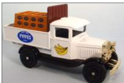
CS022 FYFFES Edition 1,500