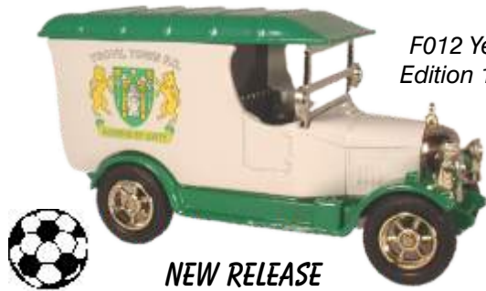
F012 Yeovil Edition 1,100