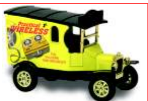
MAG012 PRACTICAL WIRELESS Edition 2,000

We're often asked about designs and more recently one of you saw a framed picture of a Thornycroft Bus (B73) for sale on E-Bay. So this month we're releasing a limited run of 20 framed pictures featuring the Practical Mechanics liveried Bullnose - an interesting addition to anyone's collection. The cost is £29.95 and the picture itself is A4 and coloured showing the various Pantone references this is an exact copy of what we release to our manufacturing department for the production of printing plates etc.