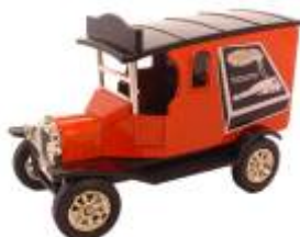
CIG054 SMOKE CLOUD Edition 2,000

A brand that was popular in the 20's and 30's targeted I guess at the 'Arthur Daleys' of the time.