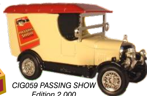
CIG059 PASSING SHOW Edition 2,000

A brand that was popular in the 20's and 30's targeted I guess at the 'Arthur Daleys' of the time.