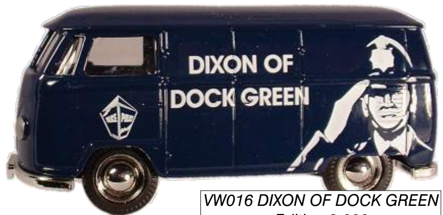
VW016 DIXON OF DOCK GREEN Edition 2,000

There was something very reassuring about Dixon of Dock Green, particularly as his idea of punishing a juvenile delinquent was with a clip round the ear. I recall the programme fondly as I would be at my grandfather's house and he would ensure that I sat down and watched the full 45 minutes, I think it was his way of disciplining me!