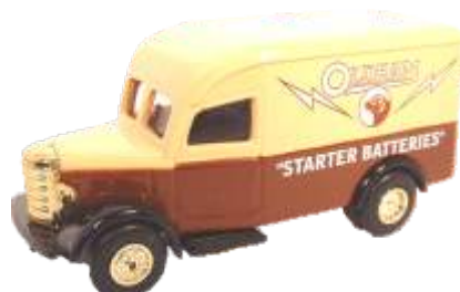
BED006 OLDHAM BATTERY Edition 1,100