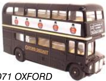
RM071 OXFORD Edition 2,000

Set of six vehicles featuring Railway Themed vehicles