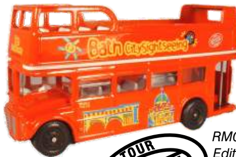
RM072 BATH Edition 2,000