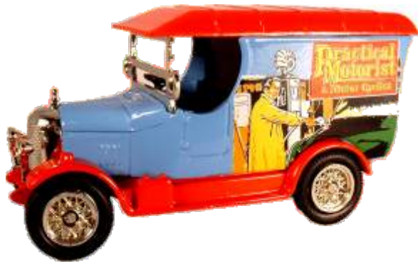
NEW RELEASE MAG010 PRACTICAL MOTORIST Edition 2,000