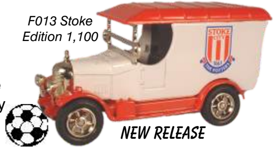
F013 Stoke Edition 1,100

Formed in 1863 by the former pupils of the Charterhouse school, Stoke City is the second oldest league club in the World. Nicknamed the Potters they currently play in the First Division. Need we remind you of their most famous football player - Sir Stanley Matthews.