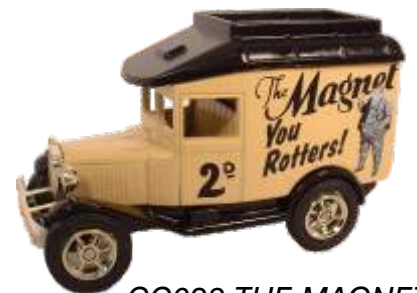
CC028 THE MAGNET Edition 1,500