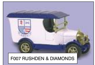
F007 RUSHDEN & DIAMONDS