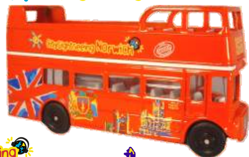
RM073 NORWICH Edition 2,000