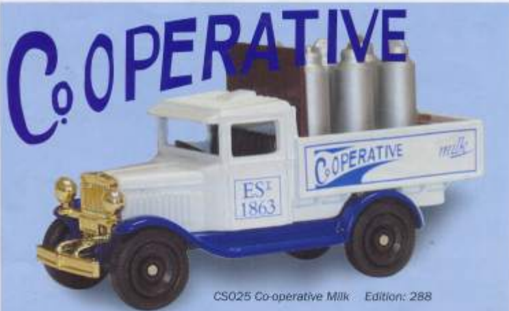
CS025 Co-operative Milk Edition: 288

Part of his story appears on the back page to give you more information on this adventurous bear.