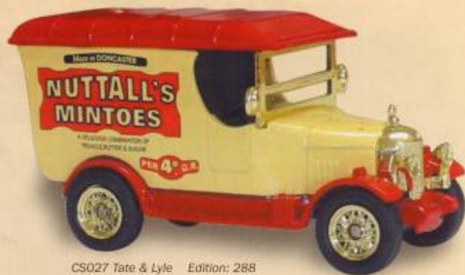
CS027 Tate & Lyle Edition: 288

When I think of Doncaster I think of Nuttall's Mintoes - why you may ask - what about mining or railways. Well I always remember collecting the empty wrappers and trying to 'smooth' them as flat as possible - the paper was a little waxy. Back then you used to get them sold from the jar and I usually managed to get a quarter. For some reason once I'd eaten all the sweets I'd take one of the wrappers and try and wrap it around the rest of the wrappers. Why I don't know, but during this process I'd examine the wrappers carefully and there on each were the words 'Made in Doncaster'.