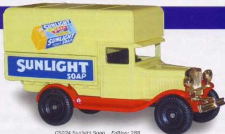
CS024 Sunlight Soap Edition: 288