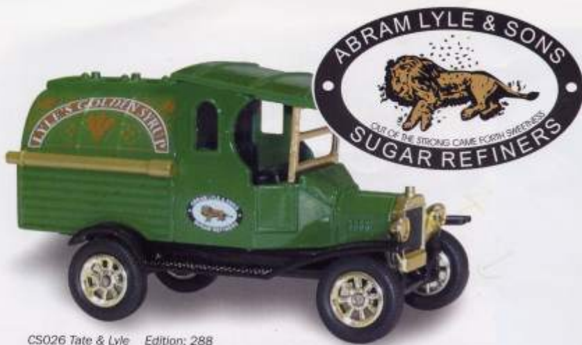
CS026 Tate & Lyle Edition: 288

In the early years the families of Tate & Lyle were competitors until their amalgamation in 1921. Henry Tate the son of a Lancashire Clergyman had moved to Liverpool as a young boy and opened some grocery shops before becoming a partner in a sugar refining company. He later purchased it and changed its name to Henry Tate & Sons and constructed a refinery before extending their activities to London. Meanwhile Abram Lyle had become interested in sugar refining through his father who was a ship owner bringing in raw sugar from the West Indies. He moved to London from Greencock and the families of Tate & Lyle had refineries within a mile of each other. After the merger the expansion of the company was rapid and they grew into a household name.