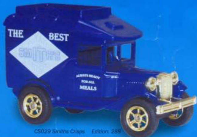
CS029 Smiths Crisps Edition: 288