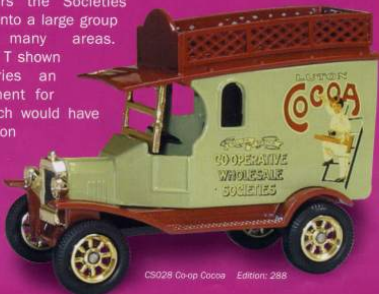
CS028 Co-op Cocoa Edition: 288

tin-plate signs during the 1920's and 1930's.