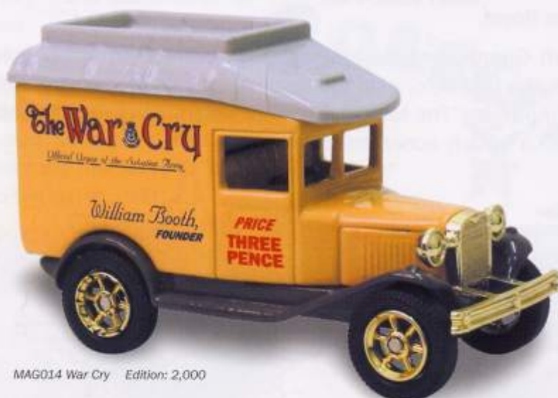
MAG014 War Cry Edition: 2,000

It was back in 1865 that William Booth, a methodist preacher, funded the Christian Mission in London's East End to help feed and help the poor. A few years later it was reorganised along military lines with the preachers known as officers and Booth as the General - it then became known as the Salvation Army. Booth sought to bring an informal atmosphere into his services with joyous singing, instrumental music and the clapping of hands. He was deeply influenced by his wife who believed that women were equal to men and she promoted the idea of women preachers. She was also deeply concerned with the low wages paid to workers and soon the Salvation Army opened its own match factory paying twice the usual wage. The first issue of the War Cry was published back in 1879 which makes this year the 125th anniversary. So to celebrate we are releasing a special Model A to commemorate the event.