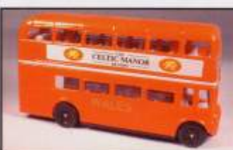
RM053 Celtic Manor