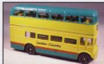
RM061 London & County