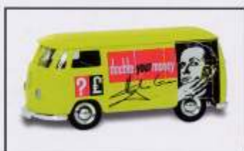
VW011 Double Your Money