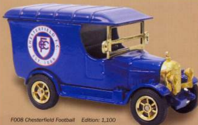
FO08 Chesterfield Football Edition: 1,100