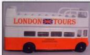
RM042 London Tours

It was such a lovely trip that for every three you choose from the selection you can choose another three absolutely FREE!