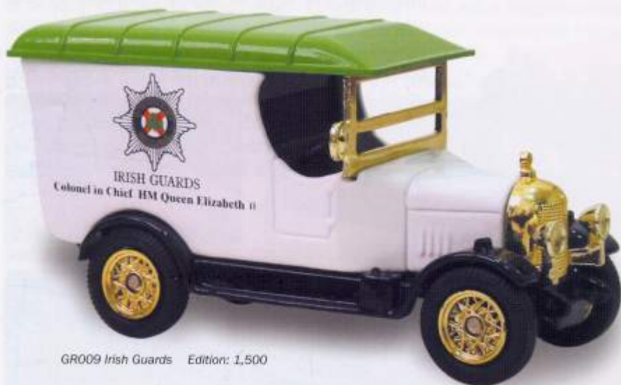
GR009 Irish Guards Edition: 1,500

The Irish Guards, originally nicknamed "Bob's Own" after Lord Roberts, the first Colonel of the Regiment, are affectionately and widely known as "The Micks". No other Regiment of Foot Guards has such a widely accepted nickname.