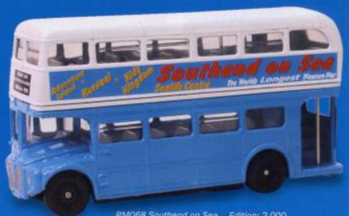
RM068 Southend on Sea Edition: 2,000

The largest town in Essex, Southend on Sea has a population of over 175,000 and is found at the mouth of the Thames estuary. The original settlement was Prittlewell from which the borough of Southend grew. RM068 is a welcome edition to the range.