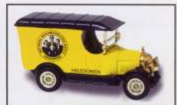
218G Neighbourhood Watch