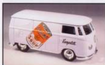
VW010 Campbells Soup