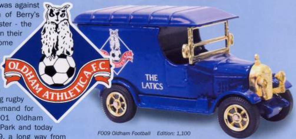
F009 Oldham Football Edition: 1,100

Their best league win was in 1962 against Stockport County when they knocked in 11 goals.