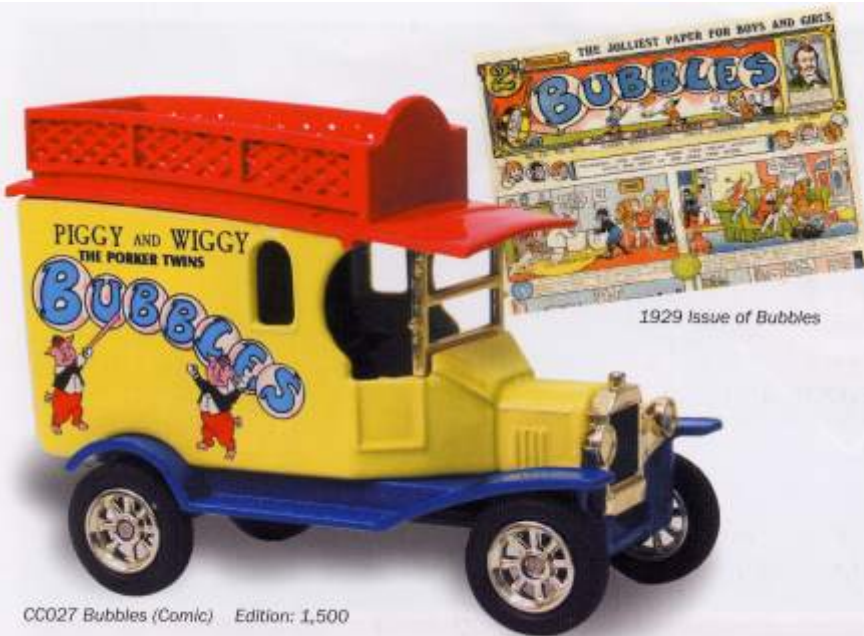
1929 Issue of Bubbles