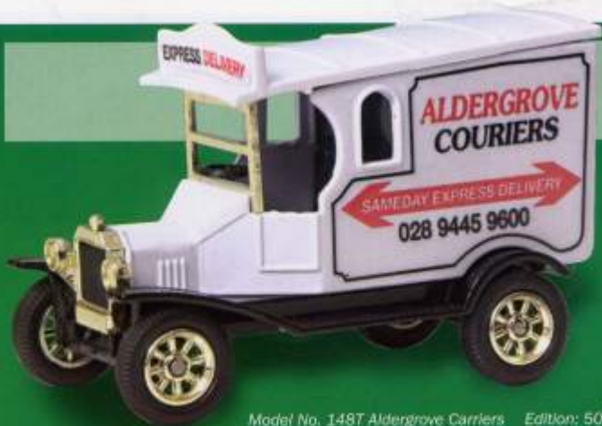
Model No. 148T Aldergrove Carriers Edition: 500

This vehicle has been released to celebrate the 10th anniversary of Aldergrove Carriers. From the edition of 500 only 192 will be available to club members.