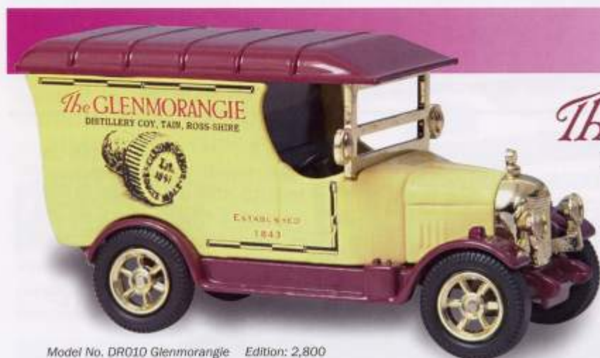
Model No. DR010 Glenmorangie Edition: 2,800

The GLENMORANGIE DISTILLERY COY, TAIN, ROSS-SHIRE