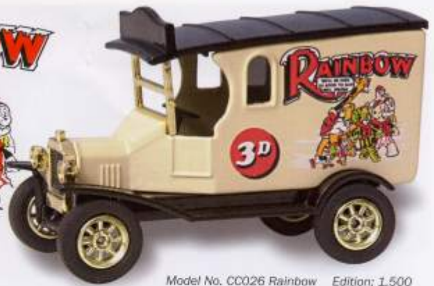
Model No. CC026 Rainbow Edition: 1,500

Our model is based on the cover of the 1943 issue - January 9th. By now the war had reduced the pages down to eight from its previous twelve - and it was only issued fortnightly. Throughout the 20's, 30's and 40's the Bruin Boys featured on the front cover - this day they were off to Dr Lions party!