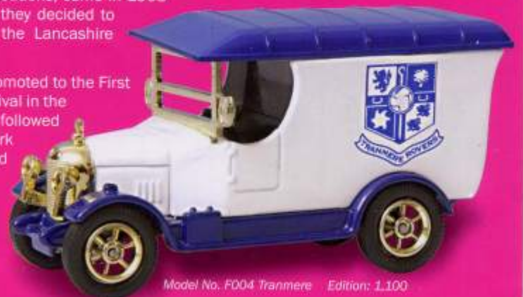
Model No. F004 Tranmere Edition: 1,100