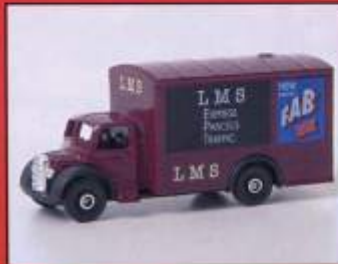
LMS Fab Van