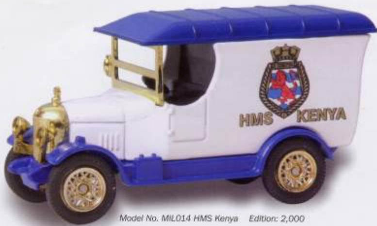
Model No. MIL014 HMS Kenya Edition: 2,000

A Fiji Class Light Cruiser, she was built by Alex Stephen, Govan being launched on the 18th August 1939. In May 1941 as part of the 2nd Cruiser Squadron she was involved in the hunt for the Bismarck. After the second world war she was re-fitted and served in the American and West Indies Station, 8th Cruiser Squadron. During the Korean War it played its part with its involvement in the Inchon landings. MIL014 is the 14th release in the series.