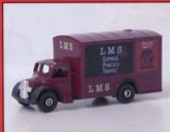
LMS Van Pilot

They come in a mailer box. You can buy them individually for £2.00 each or take the ten for £15.00.