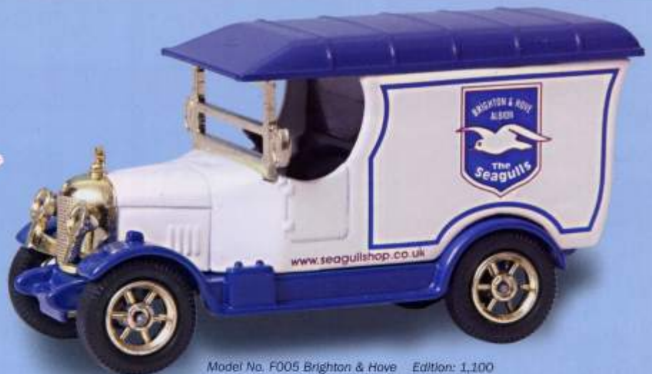
Model No. F005 Brighton & Hove Edition: 1,100

In November 1897 the first professional football club in Brighton and Hove, Brighton United, was formed. It competed in the Southern League at the County Cricket Ground in Hove from 1898, but gates were poor and the club folded in 1900 before the end of its second season.