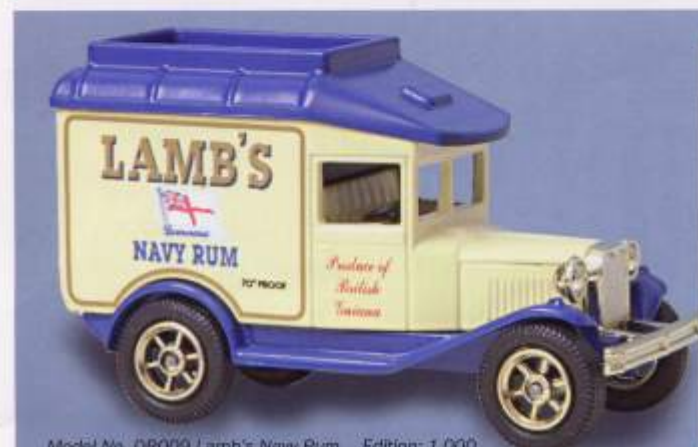
Model No. DR009 Lamb's Navy Rum Edition: 1,000