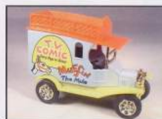
CC014 TV Comic