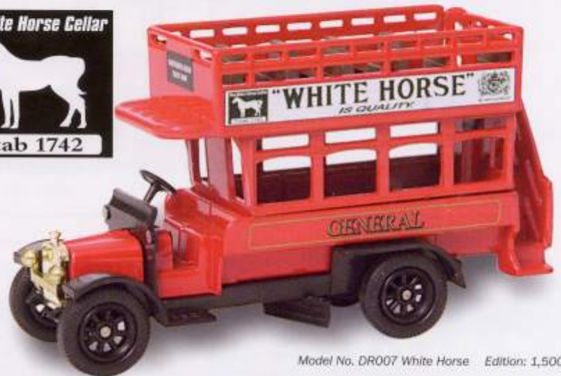
Model No. DR007 White Horse Edition: 1,500

This model has been on the drawing board for nearly a year. It takes Dusty an awful long time to finalise the drinks liveries as he needs to resample the product each time he looks at it. Anyway its finally here the brand was established back in 1742 and since then has been owned by a number of companies.