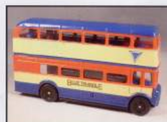
RM055 Blue Triangle

For every three you choose from the above list you can have another three absolutely FREE