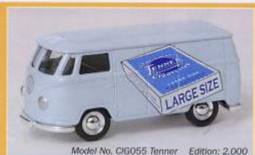
Model No. CIG055 Tenner Edition: 2,000