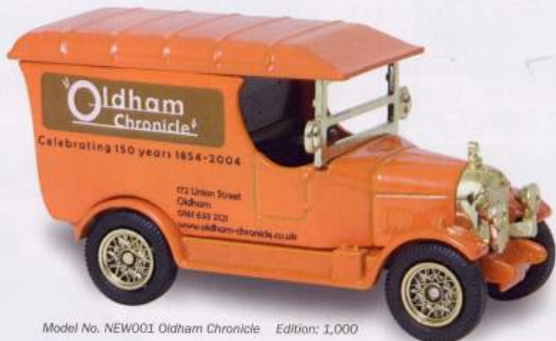
Model No. NEW001 Oldham Chronicle Edition: 1,000