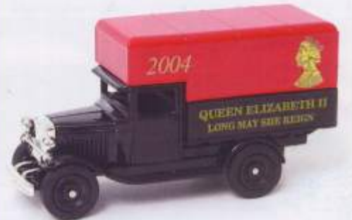
Model No. ROY010 Queen 2004 Edition: 1,000

These sold so well last year that we've only a few left. So if you want one for your collection you'll need to place an order immediately.