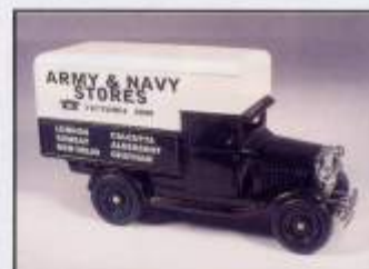
CS016 Army & Navy