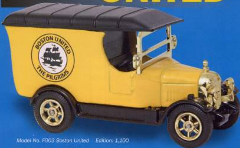
Model No. F003 Boston United Edition: 1,100

The name first appeared in 1933 although the town was always playing football at the York Street Stadium. They even entered the FA cup back in 1887 drawn against Gainsborough Trinity, but lost 7-0. By the start of the First World War there were two clubs in the town - Boston Town whose headquarters were "The Coach and Horses" and "Boston Swifts" who used "The Indian Queen". As