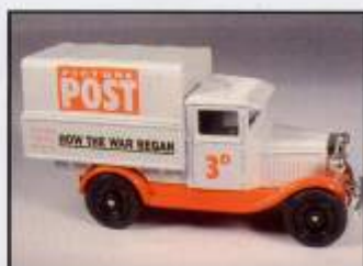
MAG005 Picture Post