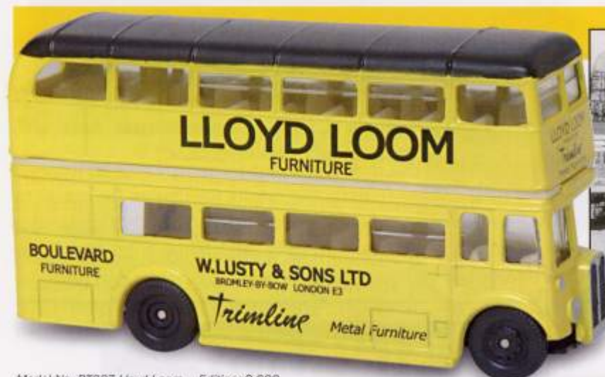
Model No. RT007 Lloyd Loom Edition: 2,000