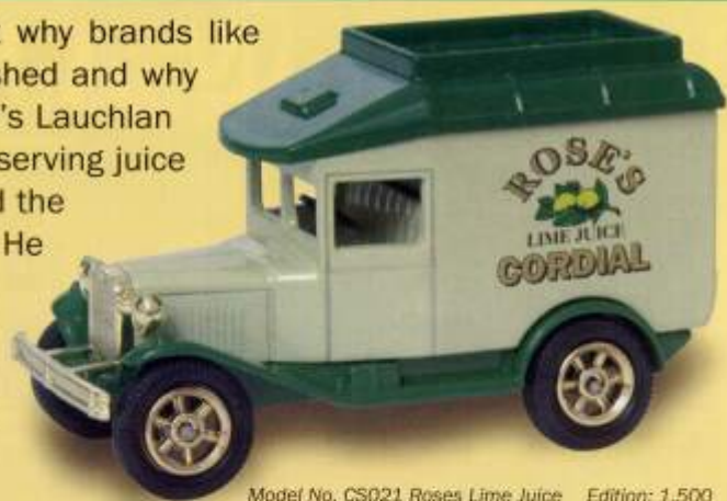
Model No. CS021 Roses Lime Juice Edition: 1,500

the West Indies. The key to his success was the need for all merchant ships to carry lime or lemon juice to prevent scurvy. Hence the reason for his thriving trade. We show Rose's Lime Juice Cordial on our new Model A which is the 21st in the series.