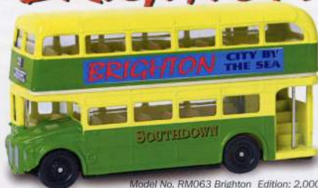
Model No. RM063 Brighton Edition: 2,000