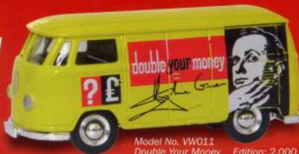
Model No. VW011 Double Your Money Edition: 2,000

We show Hughie on our VW - "And I mean that most sincerely folks"