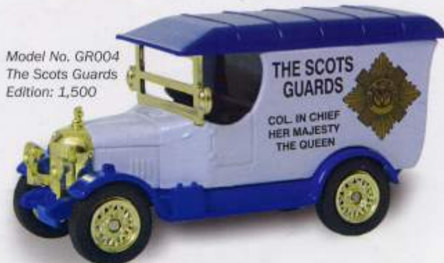
Model No. GR004 The Scots Guards Edition: 1,500