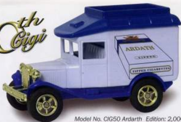
Model No. CIG50 Ardarth Edition: 2,000