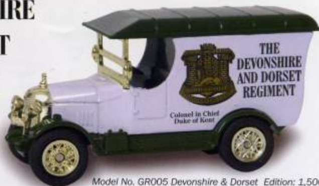
Model No. GR005 Devonshire & Dorset Edition: 1,500

Primus in Indis - This was the motto of the Dorset Regiment. It was awarded to the 39th of Foot after the victorious battle at Plassey 1757 in India, where they were the only British line regiment to serve under Lord Clive.