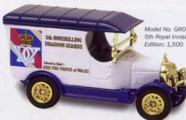
Model No. GR002 5th Royal Inniskilling Edition: 1,500