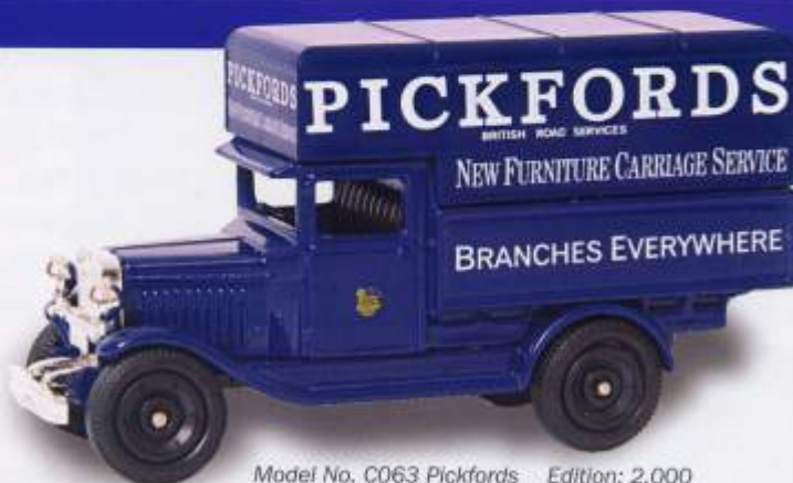
Model No. C063 Pickfords Edition: 2,000

variety of different methods to move goods around the country. In the early years it made use of horse and carts, soon these strong animals were dragging boats along the canals and at the beginning of the 19th