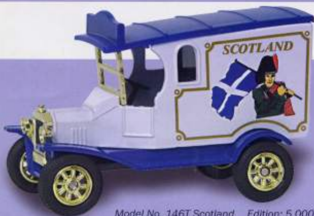
Model No. 146T Scotland Edition: 5,000

This Scottish themed vehicle has appeared in one of our recent promotions and when you purchase any model from this Globe we'll let you have her at a special price of £2.50. The soldier is brandishing The Scottish Flag which is one of the oldest national flags of any country and dates back to the 12th century. Scotland has two flags - the Saltire or St Andrew's cross (white on blue) and the Lion Rampant (yellow and red). The Lion Rampant is the Royal flag and is supposed to only be used by royalty. The St Andrew's Cross according to legend is that shape because the apostle Andrew petitioned the Roman authorities who had sentenced him to death not to crucify him on the same shape of cross as Christ, and this was granted.