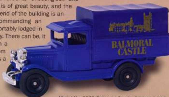
Model No. C062 Balmoral Castle Edition: 5,000