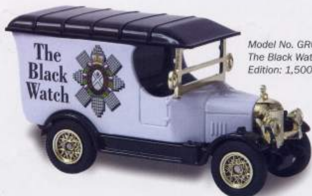
Model No. GR003 The Black Watch Edition: 1,500