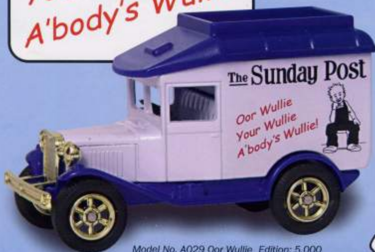
Model No. A029 Oor Wullie Edition: 5,000

The first ever Oor Wullie strip appeared in the Sunday Post Fun Section on the 8th March 1936. He was so bored and after setting off an alarm involving the local fire brigade and pulling up a tram track causing havoc he finished the cartoon once again 'bored' - AH'M FED UP! I NEVER GET ONY FUN HERE.