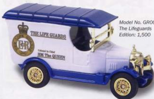
Model No. GR001 The Lifeguards Edition: 1,500