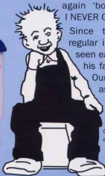
Oor Wullie as he appears today

Our Model A shows Wullie as he appears today.