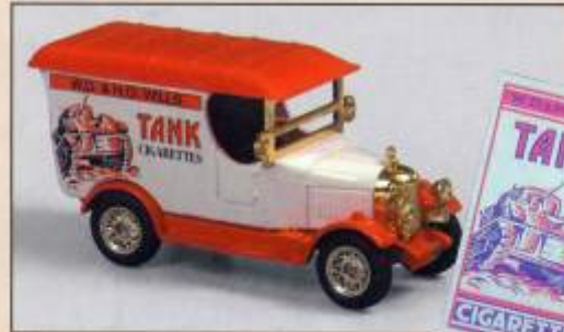
Model No. CIG028 Tank (Bullnose) Edition: 2000