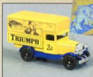
Model No. CC010 Edition: 1000