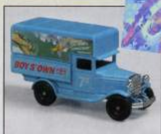
Model No. CC011 Edition: 1000