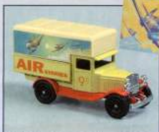
Model No. CC012 Edition: 1000