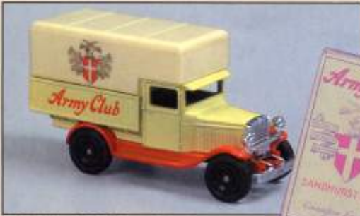
Model No. CIG027 Army (Chevrolet) Edition: 2000