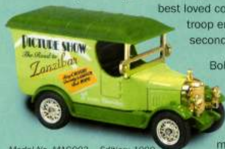
Model No. MAG003 Edition: 1000

Our model features these 3 great artists and is the third in the magazine series and featured on a Bullnose. The magazine is 'Picture Show'.