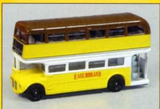
Our lovely Model is RM40 Edition: 1500

This RM certainly led a chequered life, as not only did it serve East Midlands, but Glasgow and Perth in Scotland as well.