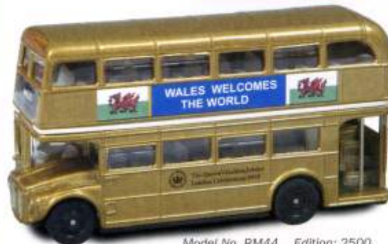
Model No. RM44 Edition: 2500

the Union Jack) on each side of the message board.