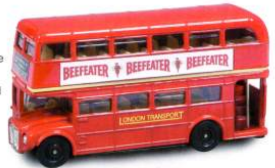
Model No. RM24 Edition: 10000