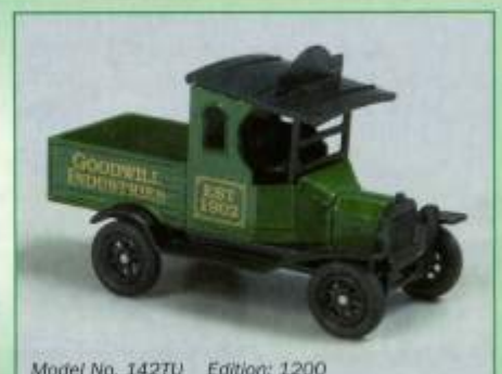
Model No. 1427U Edition: 1200

Get moving if you want one of these rare models.