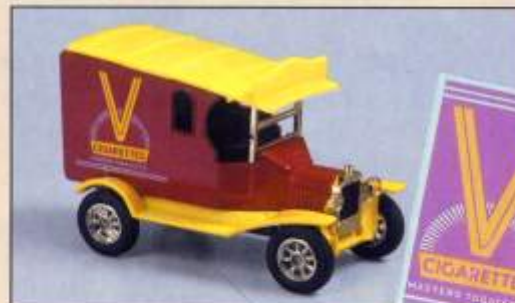
Model No. CIG030 V Cigarettes (Model T) Edition: 2000