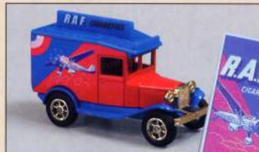
Model No. CIG029 RAF (Model A) Edition: 2000