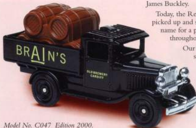
Model No. C047 Edition 2000.