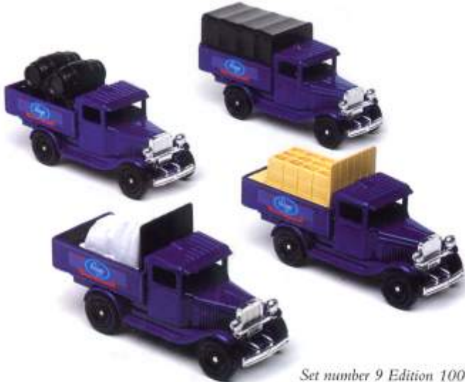
Set number 9 Edition 1000

Each set comes in a display box of 4 vehicles.