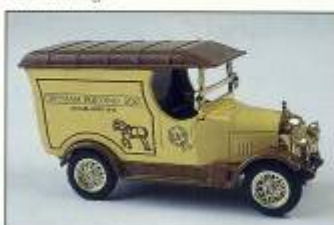
Model No. 074G. Edition 15,000

Established 1942 and still going strong. This Model T Milk Churn truck carries the old Chesham Dairies logo style and telephone number.