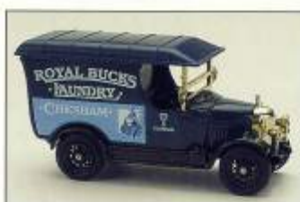
Model No. 086. Edition 5,000

Established 1889 and still printing! This Bullnose is typical of those used as delivery vans, and features the original telephone number and printers name. The Bucks Examiner will be featuring all four of these vehicles.