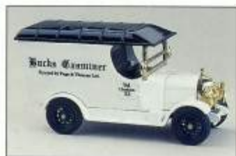
Model No. 133. Edition 2,500