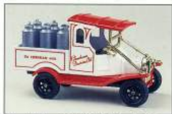
Model No. 065T. Edition 2,500

Established c. 1920 and long since gone! This laundry was founded in Chesham with a second laundry in High Wycombe. It features a Bullnose with the Dutch girl original logo and telephone number.