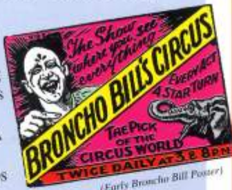
(Early Broncho Bill Poster)

Old Broncho did well and we are having many requests particularly from the USA for more of them - perhaps a new range!