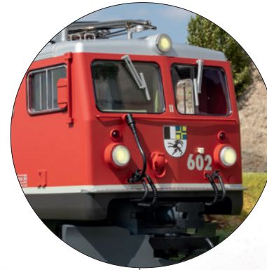
Locomotive body as new tooling with altered ends

This is a model of a Rhaetian Railroad class Ge 4/4 I electric locomotive, road number 602. This is a reproduction of the converted locomotive with new ends. The red paint scheme and lettering are prototypical for Era VI. Four wheelsets driven by two powerful, ball bearing Bühler motors. The locomotive has an mfx/DCC decoder with many light and sound functions. It also has double-arm pantographs driven by servomotors that can be controlled digitally. The roof equipment is prototypical. Length over the buffers 54 cm / 21-1/4".