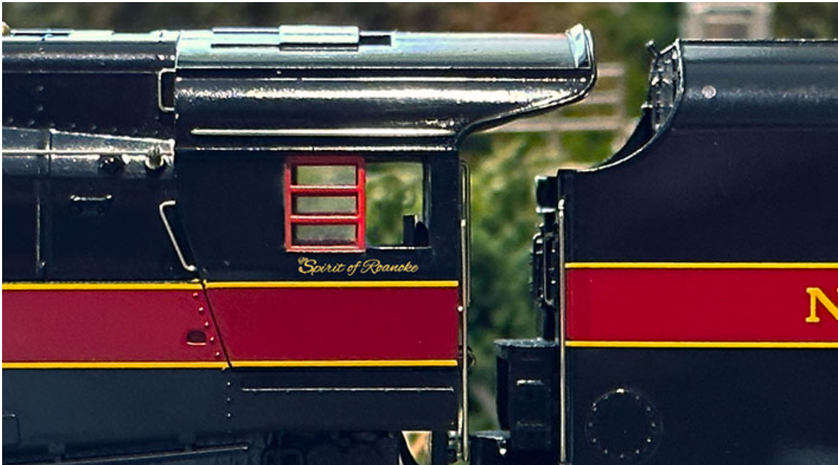
Returning to Stock