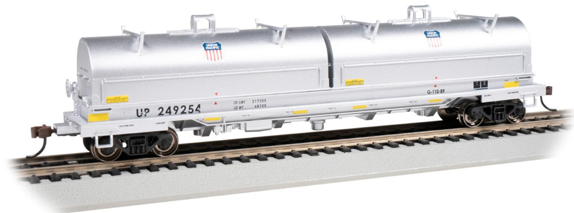
UNION PACIFIC® #249254 Item No. 71404