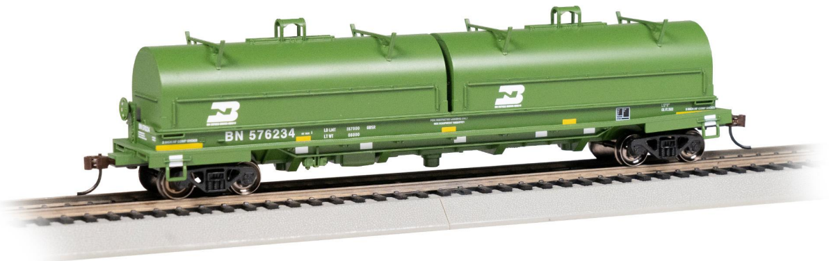
BURLINGTON NORTHERN #576234 Item No. 71406