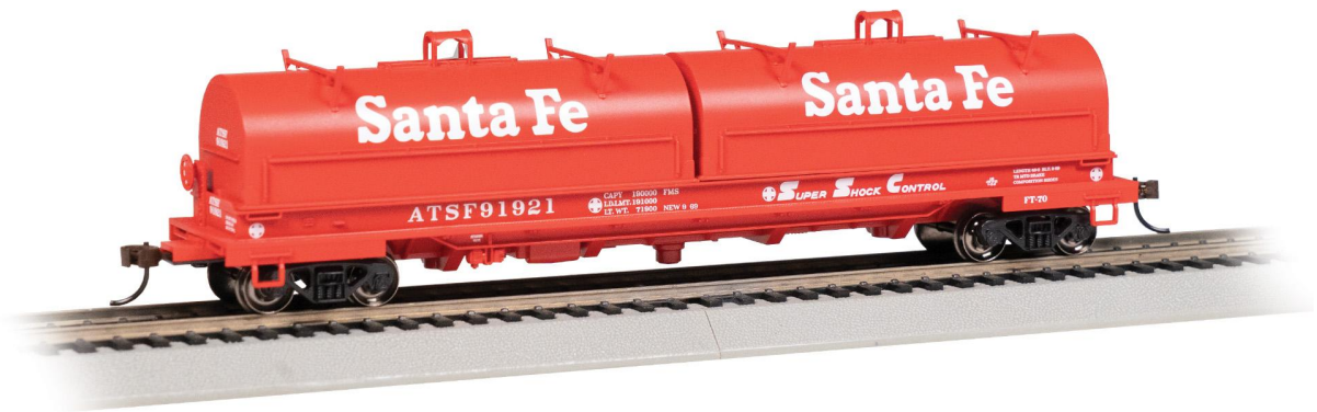
SANTA FE #91921 Item No. 71405