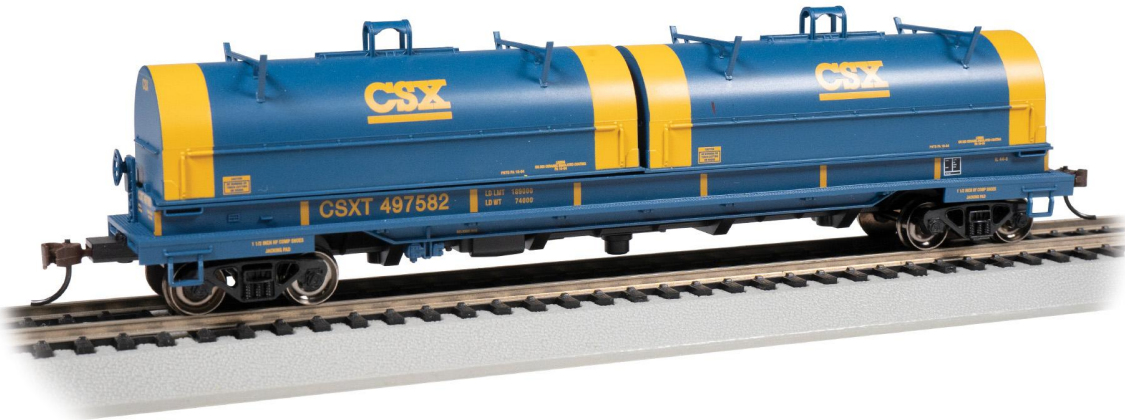
CSX® #497582 Item No. 71402