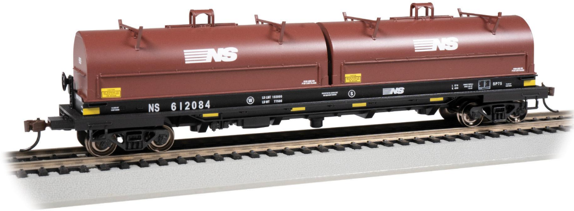
NORFOLK SOUTHERN #612084 Item No. 71403