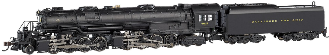
B&O® #7618 (EARLY LARGE DOME) Item No. 80856