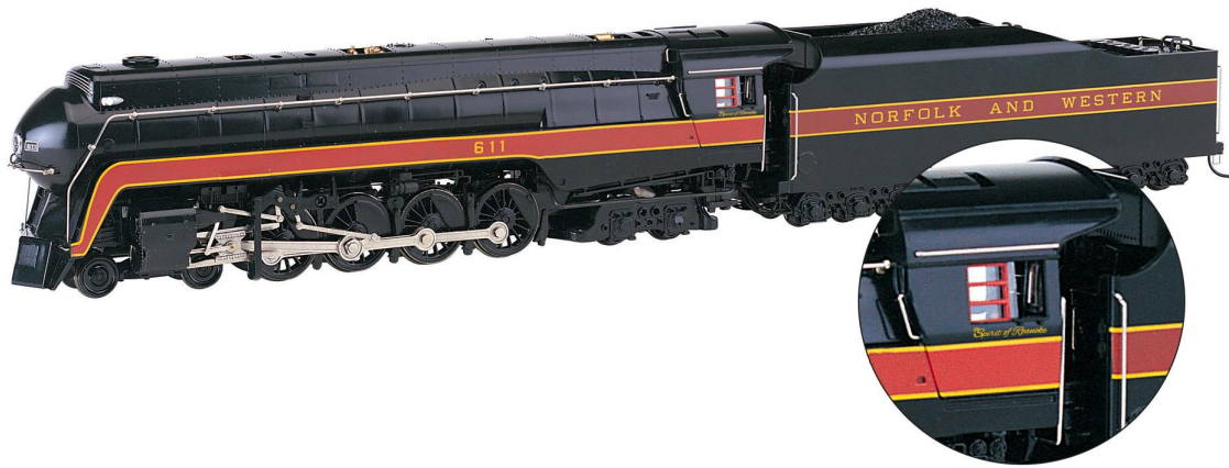
N&W #611 - "Spirit of Roanoke" Item No. 53203