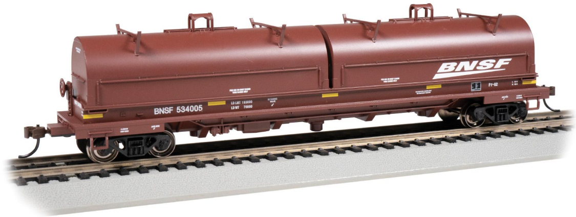
BNSF #534005 Item No. 71401