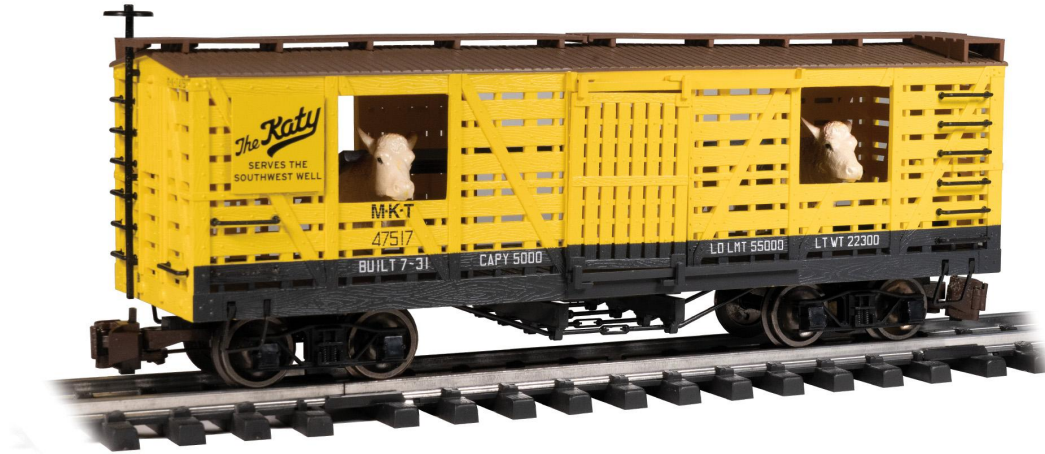
MKT™ with CATTLE Item No. 98708