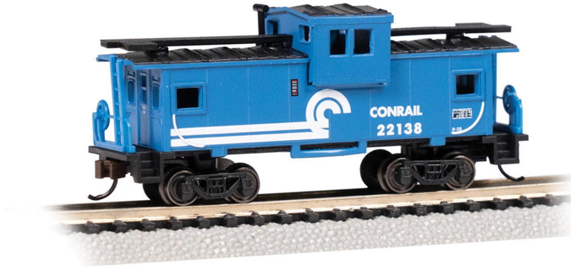
CONRAIL #22138 Item No. 70770