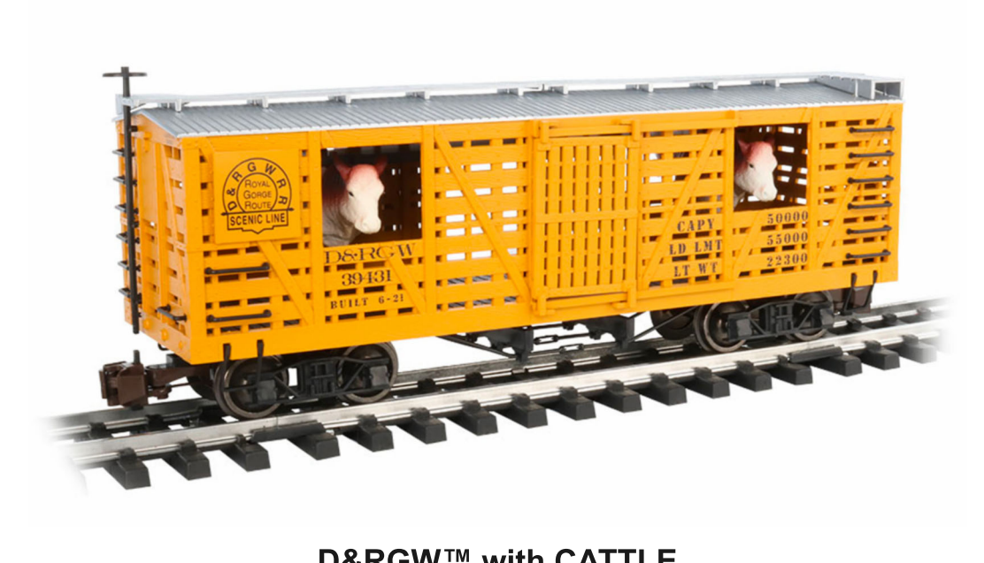
D&RGW™ with CATTLE