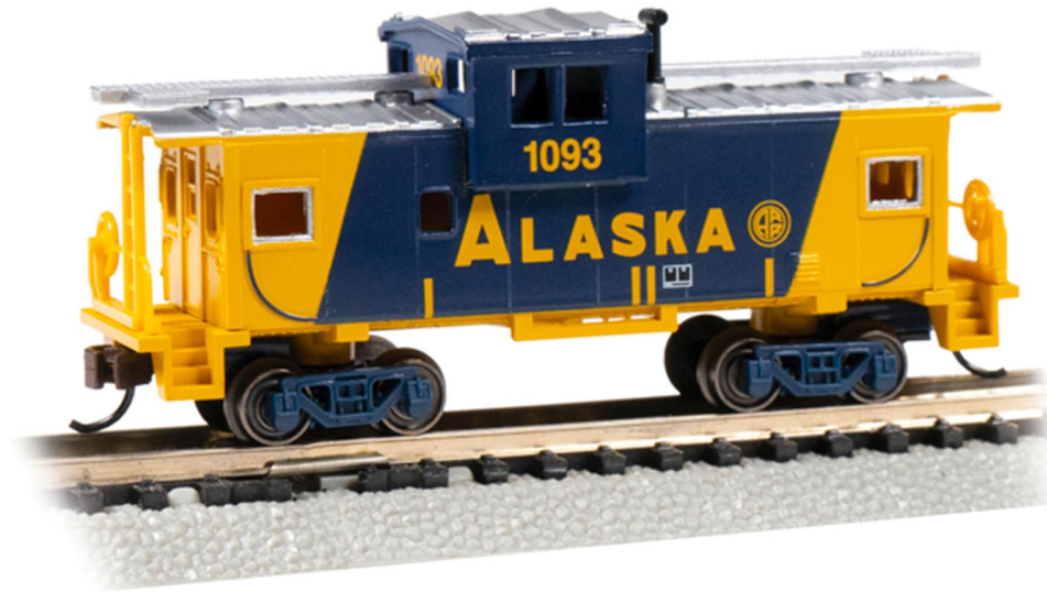
ALASKA #1093 Item No. 70769