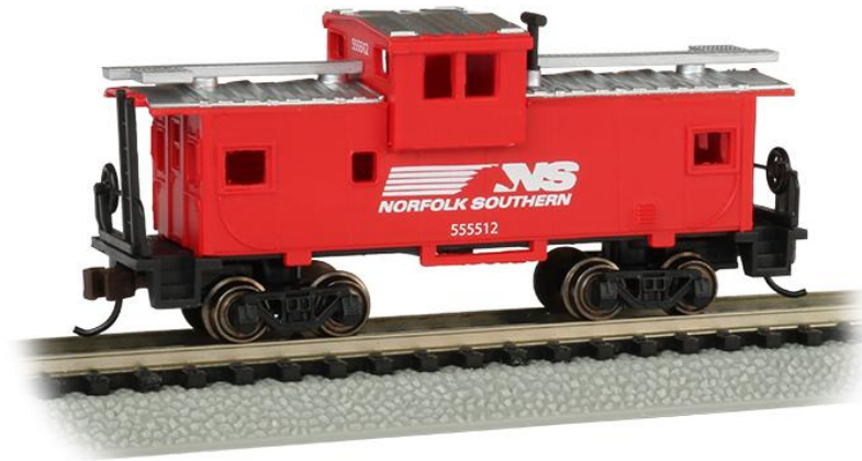
NORFOLK SOUTHERN #X501 Item No.70756