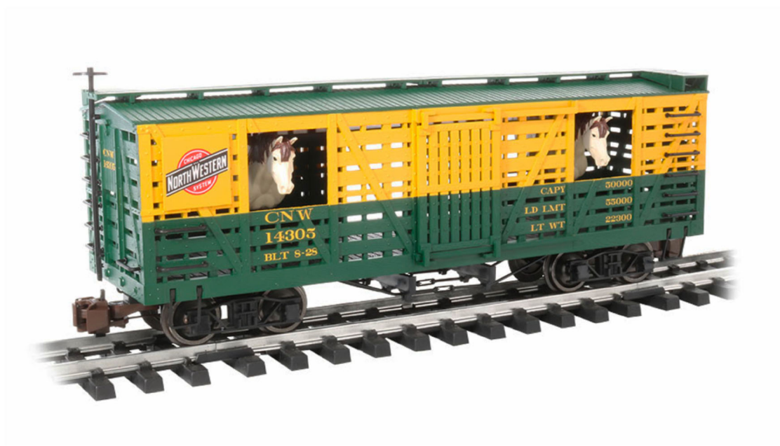
C&NW™ with HORSES Item No. 98705