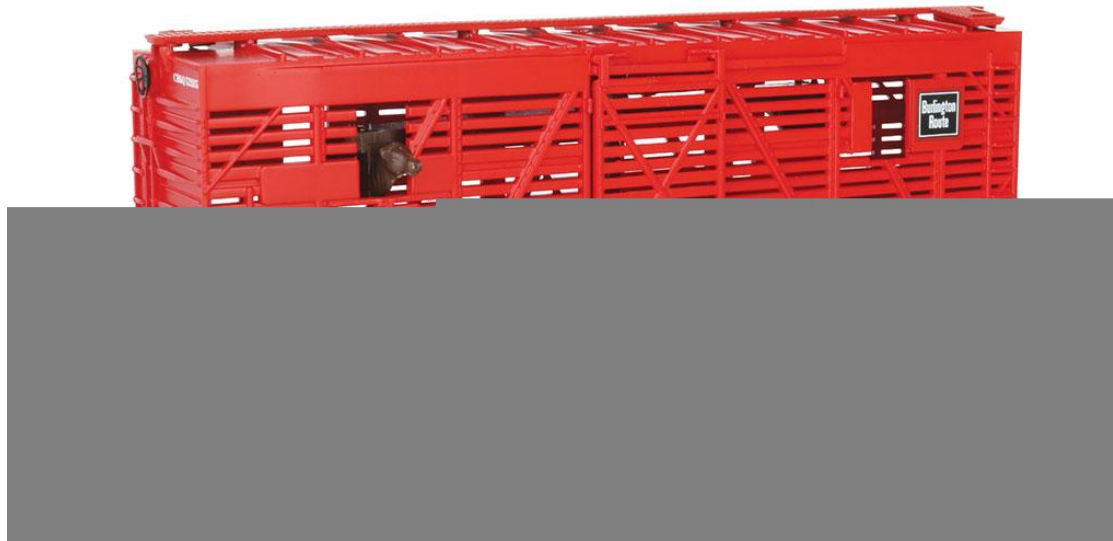
BURLINGTON #52015 with CATTLE Item No. 19710