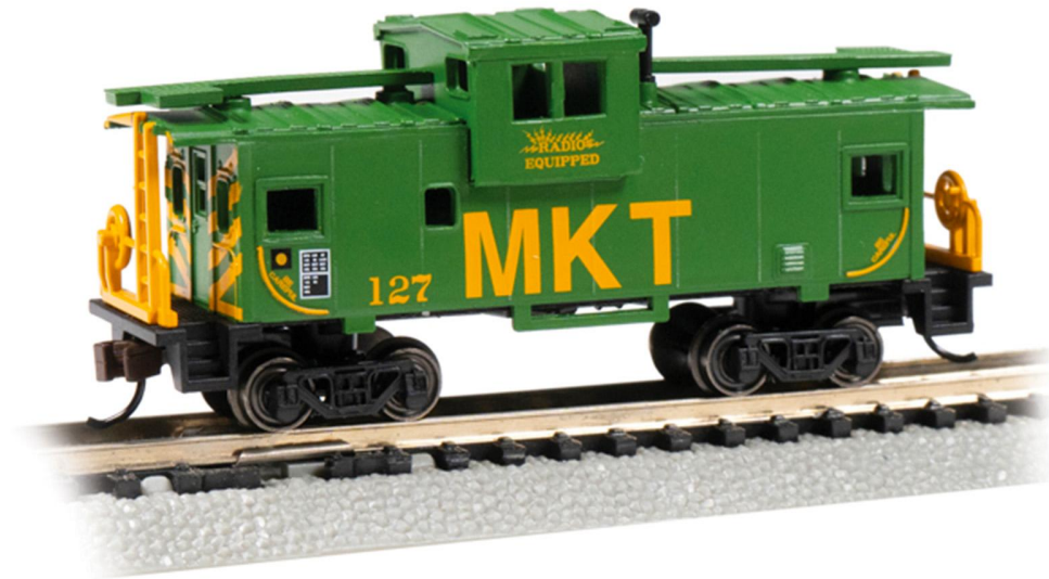
MKT™ #127 Item No. 70771