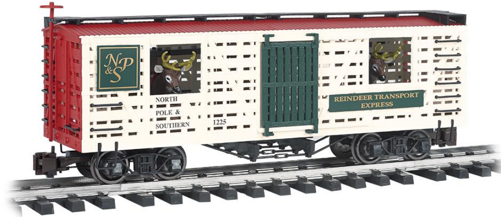
CHRISTMAS NP&S® with REINDEER - WHITE & RED Item No. 98704