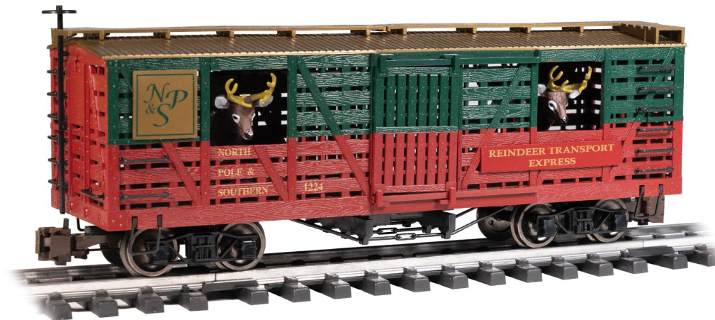
CHRISTMAS NP&S® with REINDEER - GREEN and RED