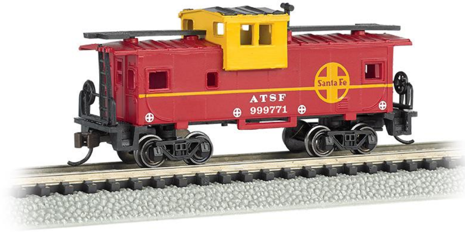
SANTA FE #999771